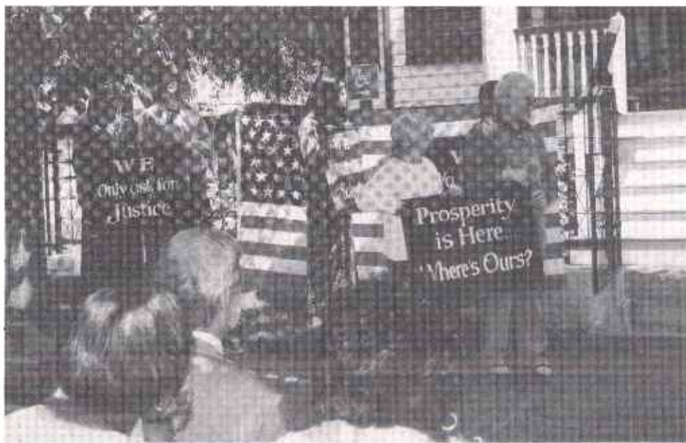
Children participate in the reenactment at the Botto House.