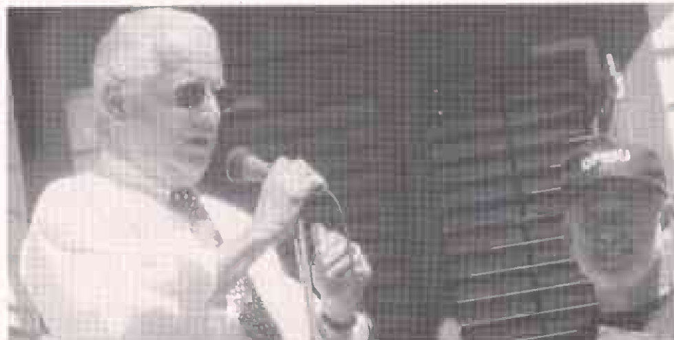
Representative Bill Pascrell (D-NJ) addresses the New Jersey Labor Day parade.