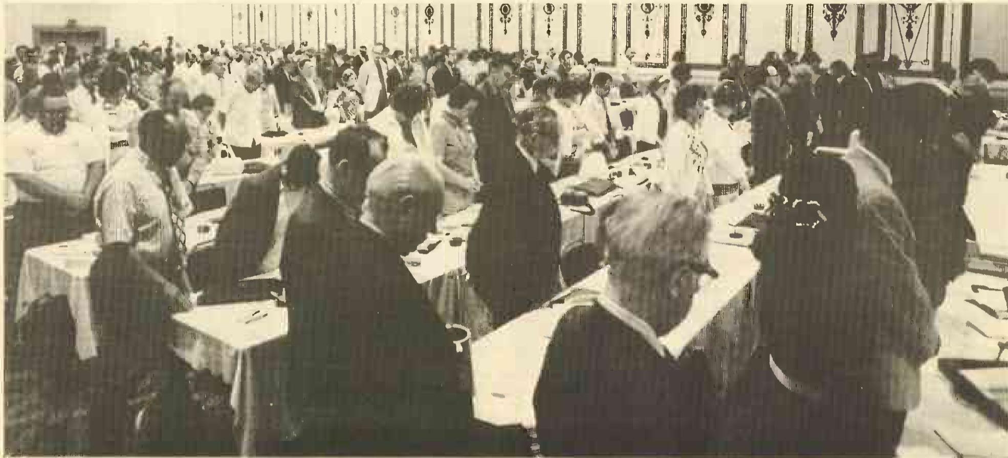
STANDING IN SILENCE, DELEGATES TO 12TH CONVENTION PAY THEIR RESPECTS TO THOSE WHO HAVE DIED SINCE THE 11TH.