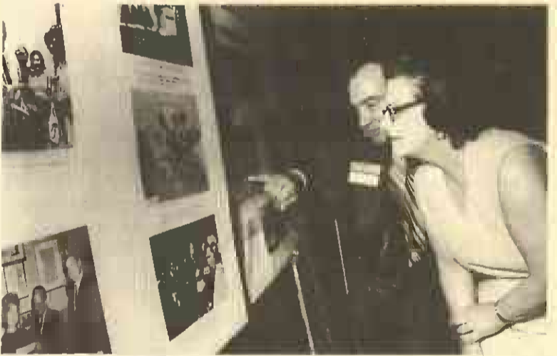
Photo exhibits depicting the union's history and record of achievement were closely scrutinized by delegates.

The Douglas Award is an annual grant to the individual responsible for recruiting the most new OPEIU members during the year.