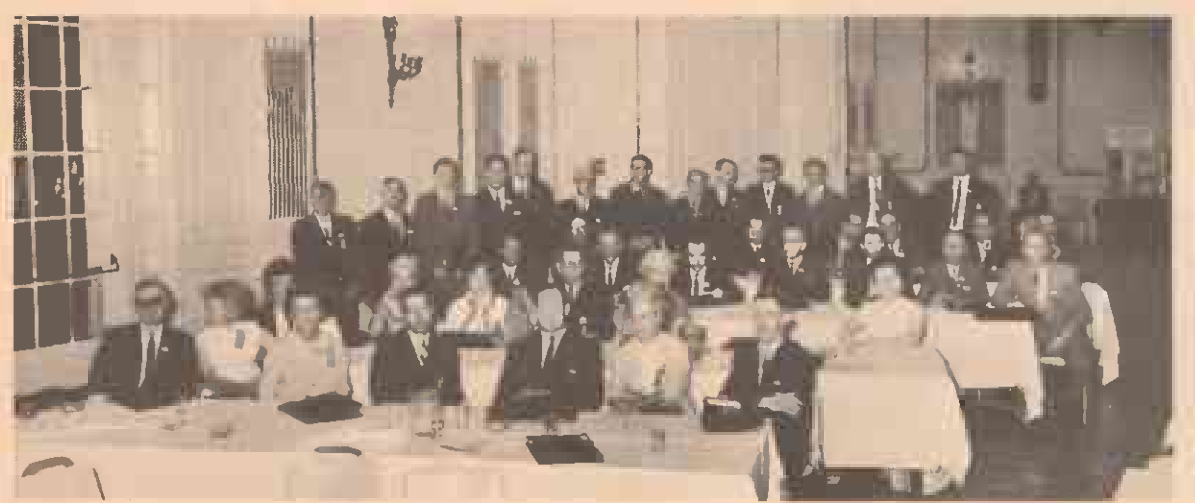
Canadian delegates gathered for this group photograph.