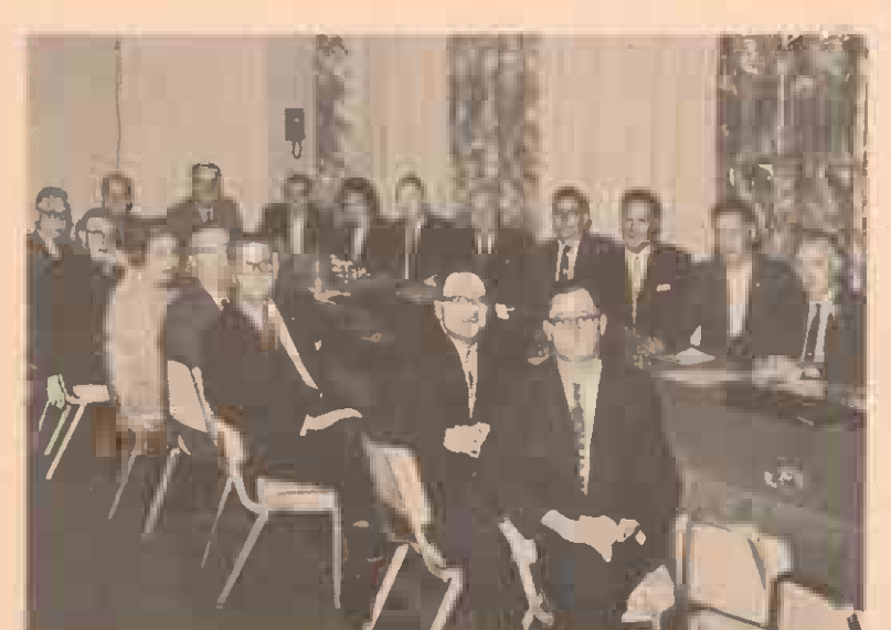
Post-convention meeting of the International Executive Board.

adopted providing that local unions charge a minimum of $2 initiation fee, with a $35 maximum, and regular monthly dues of not less than $3 and not more than $7.