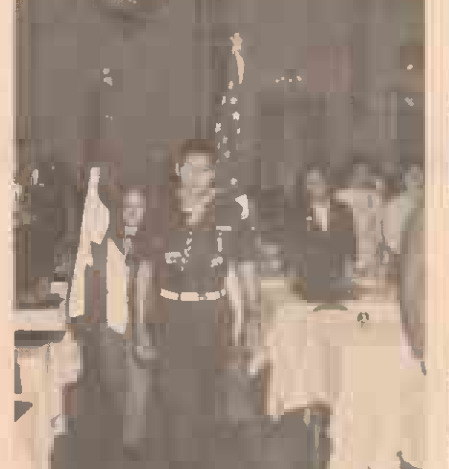
Boy Scouts of Troop 45 flanked by national flags.