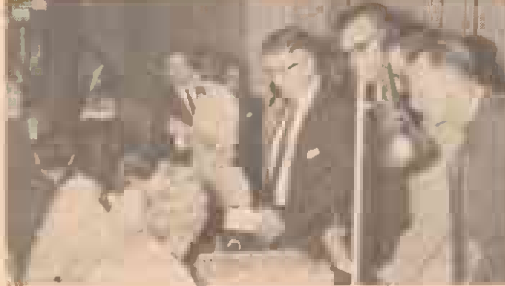
Opening day registration of delegates.

We deeply grieve their passing and extend our deepest sympathy to the families and friends of both these devoted Brothers.