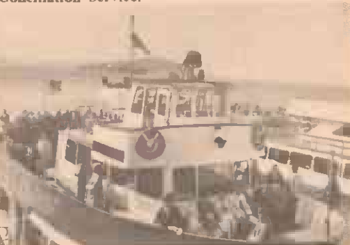
Delegates departing on a late afternoon cruise