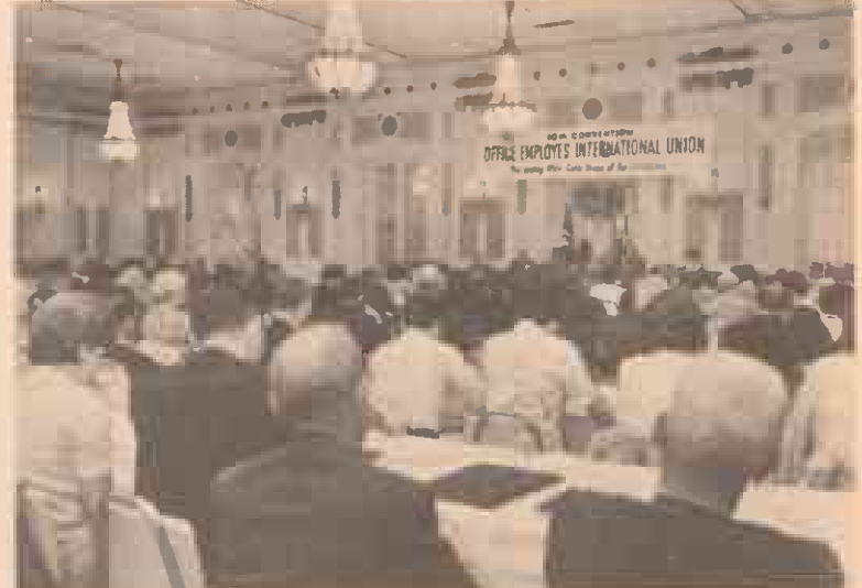
The way the 10th Convention looked in session from the rear of the hall.

Board, calling for each local union to pay into the fund 15 cents per member per month. After the fund has built up, strike benefits to be determined by the (Continued on page 8)