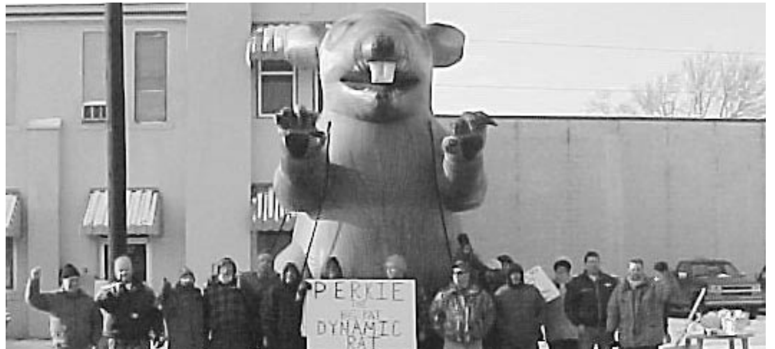
"Perkie the Big Fat Dynamic Rat" lends his support to striking workers.

pital for treatment and released. Brother Ulrey is now proudly back marching on the picket line. Despite the pressure, poor weather and the holiday season the workers have vowed to remain strong until a fair and equitable contract is won!