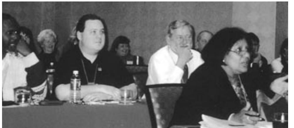
Members participate in the West/Northwest and Northeast Educational Conferences held in Seattle, Washington, October 4-5, 2002 and Providence, Rhode Island on November 23-24.