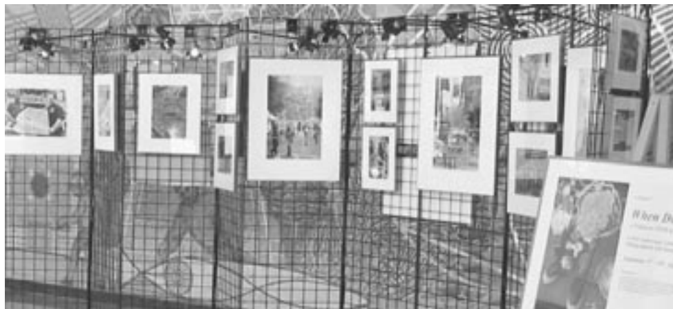
The AFL-CIO's photo exhibit honoring the working heroes of September 11.

Even in times of despair, the American spirit is triumphant. This was tested on September 11, 2001. The challenge was met head on. The working men and women were united and their solidarity was captured on film to be shared, honored and not to be forgotten.