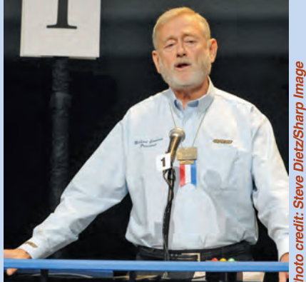
President Michael Goodwin address- Resolution 39 on Helicopter Safety.

ing the underprivileged." President Goodwin addressed the delegates in support of Resolution 39 on Helicopter Safety, calling on the AFL-CIO and its Transportation Trades Department to continue to monitor the FAA's progress in establishing increased minimum safety standards in regards to training, maintenance, weather and rest periods for helicopter pilots and flight crews. He also told delegates of the FAA's establishment of a new satellite-based Air Traffic Control (ATC) system that will go into effect in December, significantly improving safety, capacity and efficiency in tracking aircraft es the Convention in support of flying over the Gulf of Mexico.