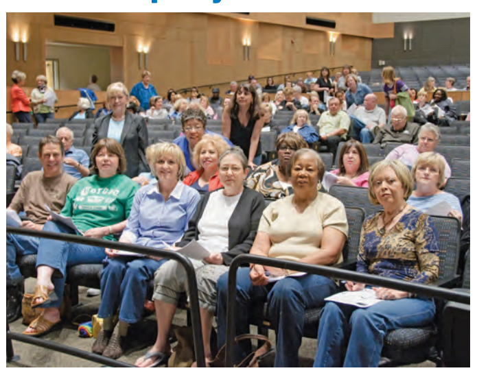
Local 277 members at Lockheed Martin Aeronautics Company prior to the ratification meeting.

Several key job descriptions were improved to ensure they protect and more clearly define the work that Local 277-repre-