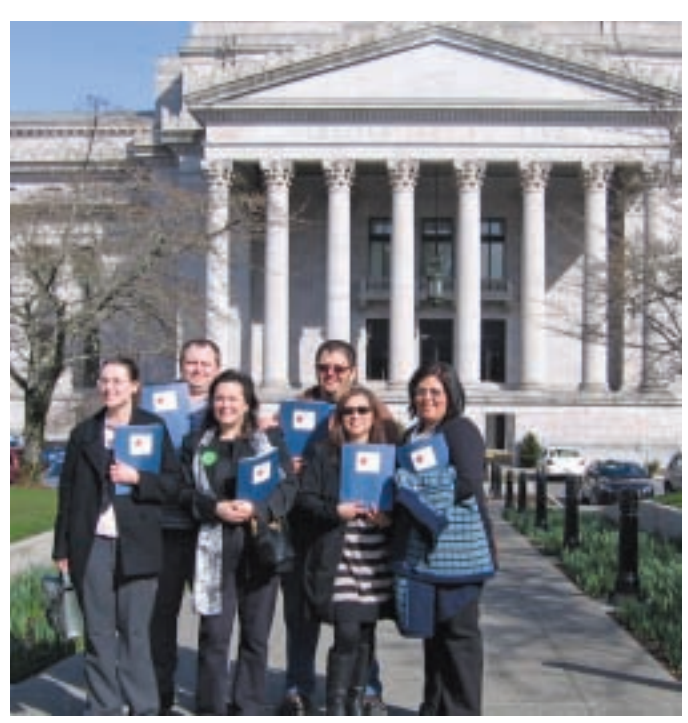
Local 8 members from Community Health Center La Clinica and Sea Mar Community Health Center advocate to protect Medicaid funding at the state capitol in Olympia, Washington.