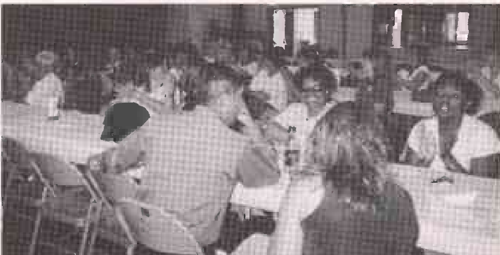
Wanigas employees, members of Local 393, are happy with the contract.

We are confident that we will succeed in giving our members the understanding that despite these precarious times, union people will prevail and solidarity is alive and well!