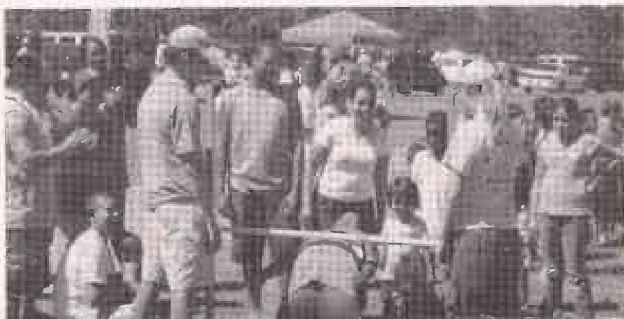
Local 30 members do the limbo!