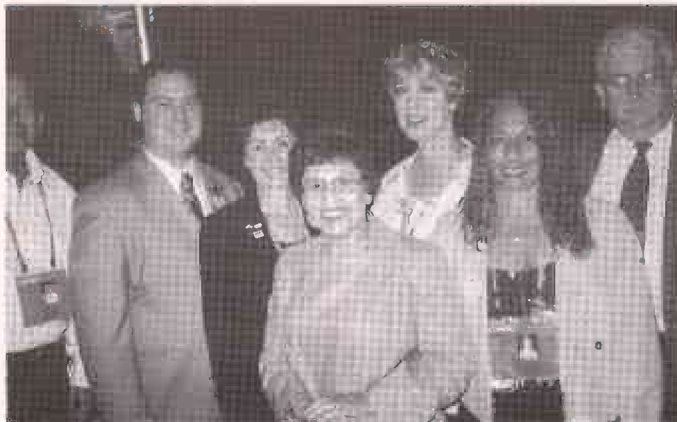
AFL-CIO Executive Vice President Linda Chavez-Thompson is pictured with convention escort committee.

Chavez-Thompson then reiterated the importance of the 2004 presidential election and a campaign to restore workers' freedom to join unions. She also stressed the importance of pressuring Congress to pass the Employee Free Choice Act. There are 42 million workers in America who are not part of the union movement that would like to join but cannot, because when they try employers use intimidations, lies and firings to stop them and the law does little or nothing to protect them. Chavez-Thompson expressed the importance of not only passing the legislation, but to also elect a president who will sign it. She said all union members have to get involved in the political process, to "make it your own personal mission" to help elect the right person in November and "to tell the truth about George W. Bush" to fellow union members, friends and neighbors.