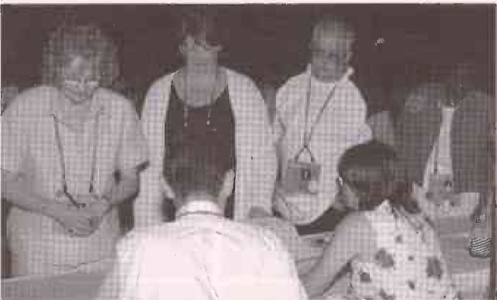
Convention delegates receive ballots for vice president elections.