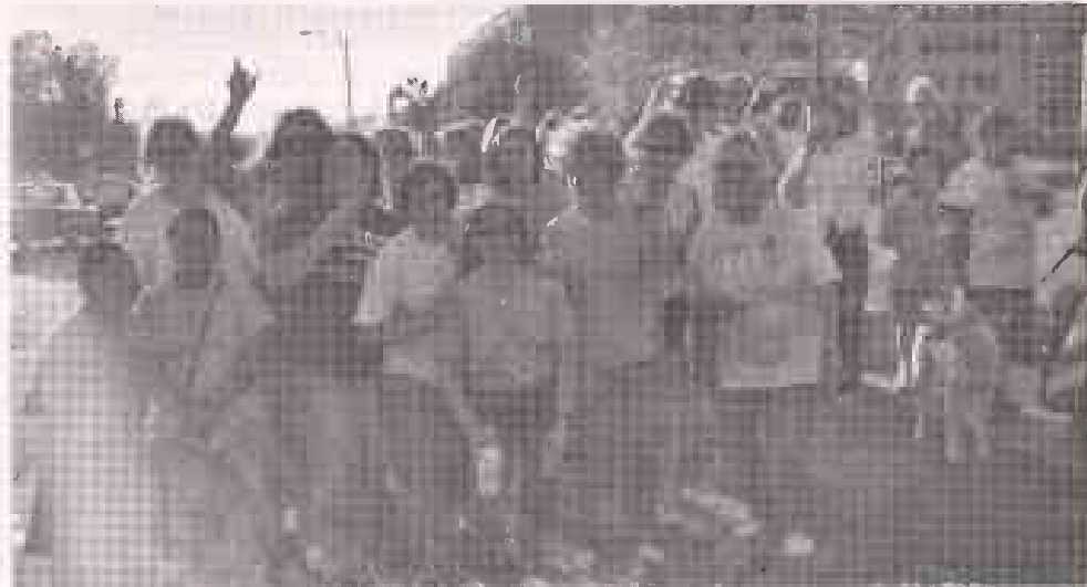
Nurses celebrate their contract victory!