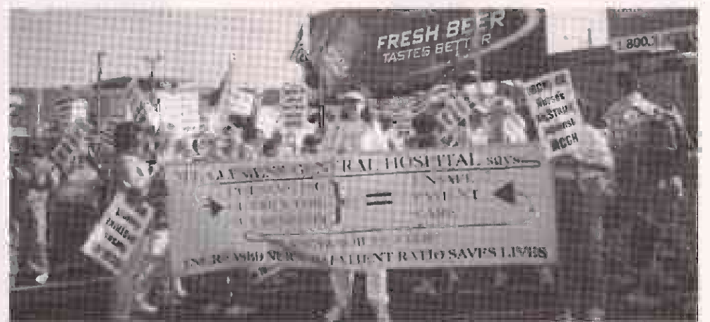
Local 40 nurses at Mt. Clemens General Hospital walk the picket line.