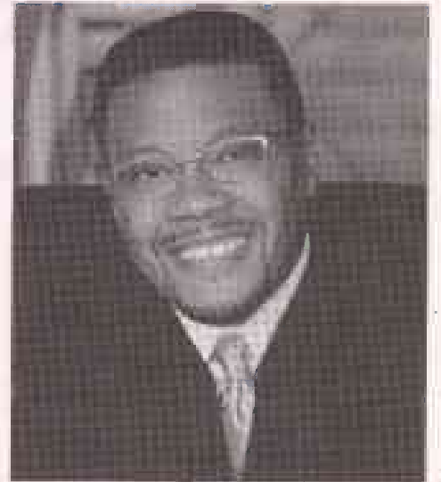
Judge Greg Mathis

"We thank God for the unions, because it was the labor movement of those years that fought back and helped to elect a new pres-