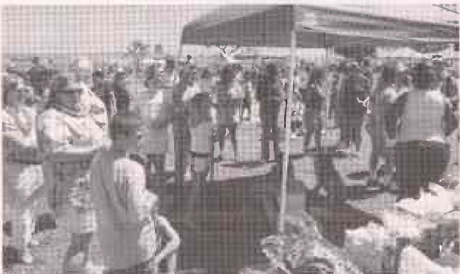
Local 30 members and families have a great time at the Family Fun Day.