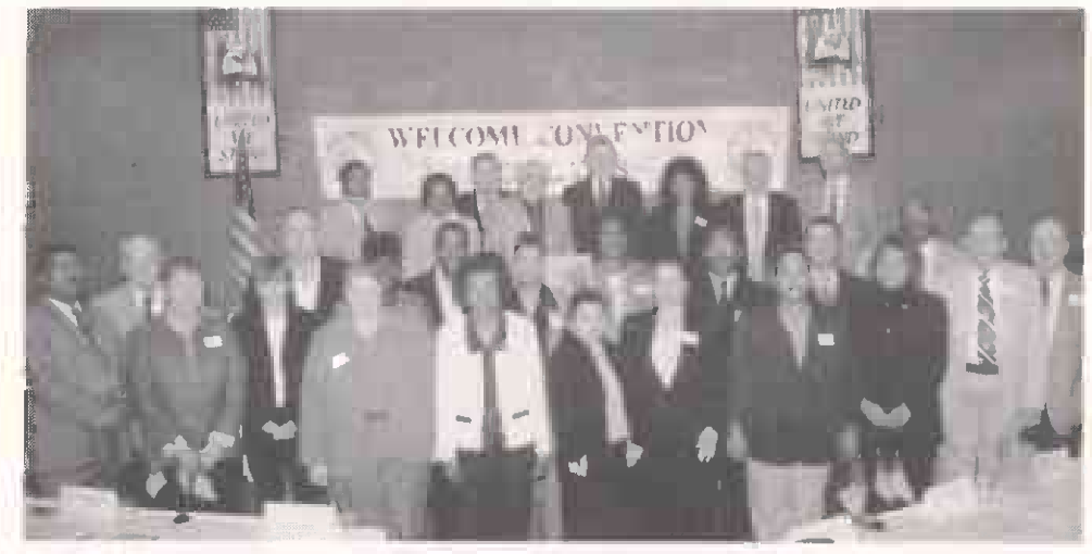
ITPE convention delegates.

"The AFL-CIO is hard at work on behalf of Enron's workers — not necessarily because they are union members, most of them aren't — but simply because they are working fami-