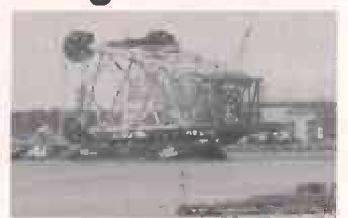
Stavanger, Norway serves as a hub for North Sea offshore oil operations.

The IFALPA serves as the global voice of airline pilots, promoting uncompromised levels of aviation safety while providing a broad