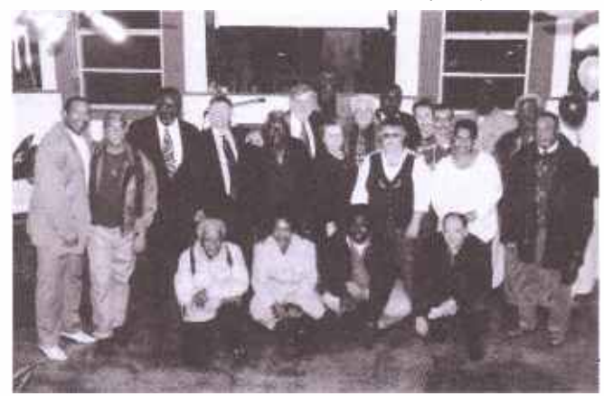
Taxi drivers meet at general meeting in New Orleans, La. in February 26.