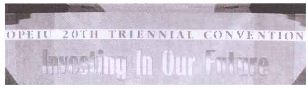
Theme of the 1995 convention.