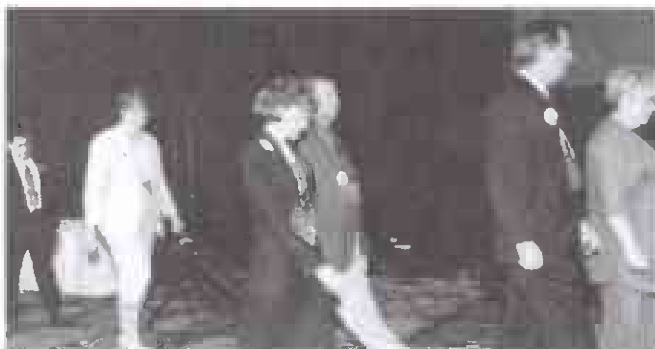
Former Attorney General Janet Reno and her convention escort committee.