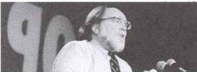
Representative Neil Abercrombie (D-HI)

Representative Neil Abercrombie (D-HI), a senior member of the Armed Services Committee in the House of Representatives, fervently called on OPEIU, and the labor movement in general, to take power from those who are fighting against working families.