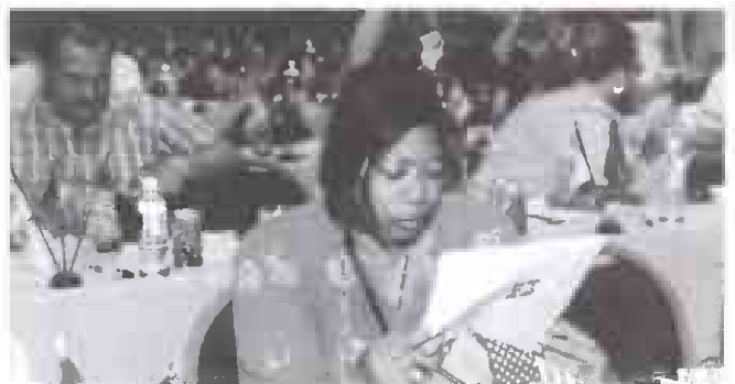
A convention participant reads Delegate .