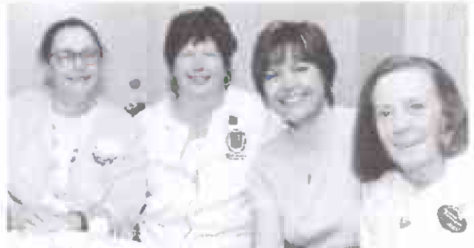
It's all smiles at the convention.