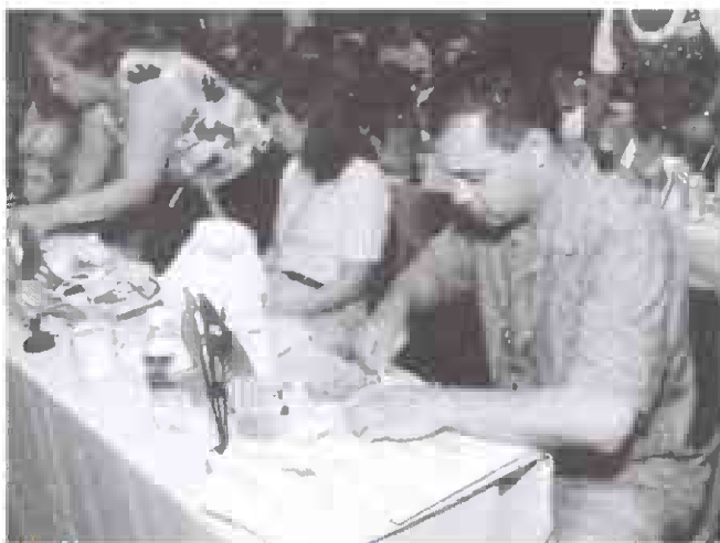
Delegates relax and confer before the morning session begins.