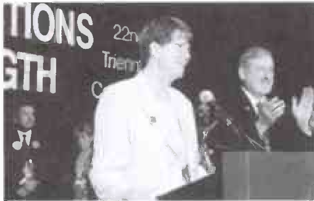
Former Attorney General Janet Reno

Reno added that the government must reduce class size and increase compensation for teachers. She gave several examples of how schools and education can help not only students, but adults as well.