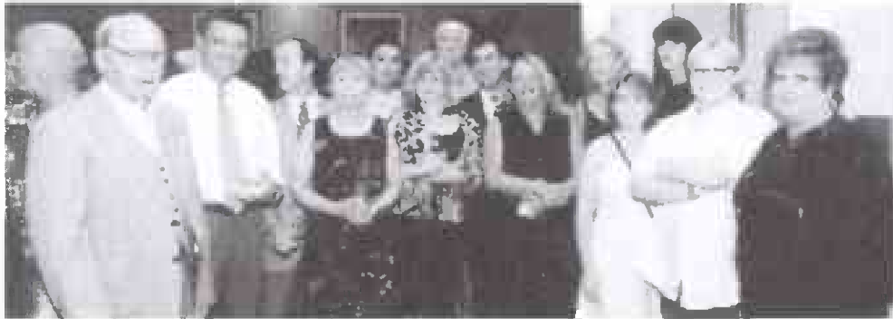
A happy group of delegates, guests and spouses.