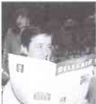
A convention delegate enjoys the daily newsletter, Delegate .