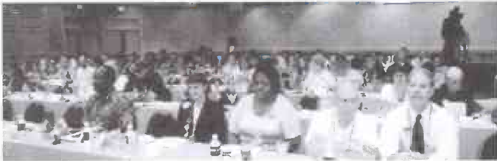
Delegates in session.