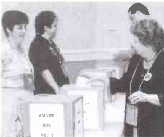
Delegates vote for the OPEIU Executive Board.