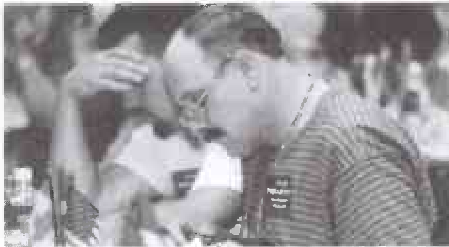
Delegates at work.