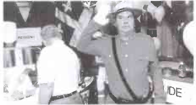
A "Canadian Mounty" gives a salute to all Canadian delegates.