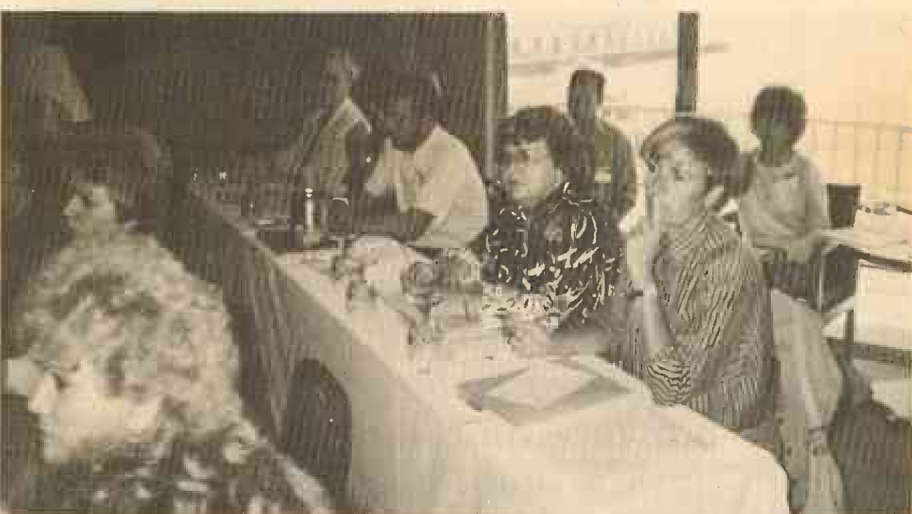
UNION LABEL NEWS FEATURE - For Immediate Release From Union Label Department Int'l Ladies Garment Workers' Union 275 7th Acqueux, New York, N Y 10001

Presentation was great. Given in easy, logical procedures. I learned a lot in a relaxed atmosphere.