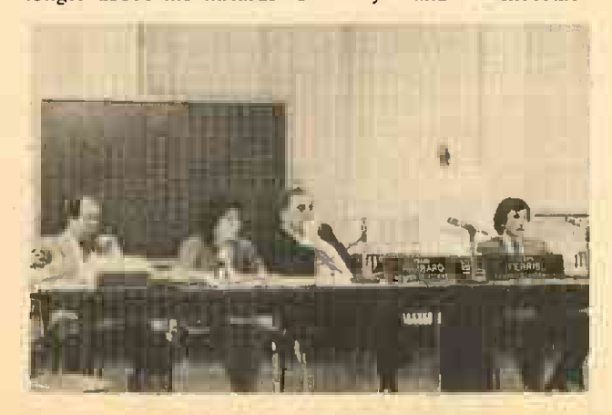
The New York State Assembly Committee on Labor's leaders listen to testimony on the health hazards of VDTs.

There are few responsible individuals that argue any longer about the hazards to the eyes and the musculo-