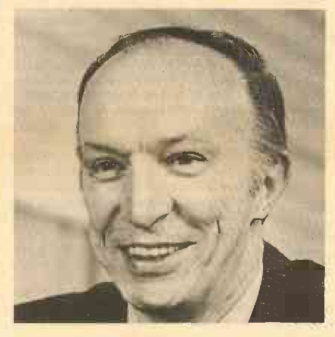
Thomas R. Donahue

The AFL-CIO rates legislators on their votes in the House or Senate. The legislator is given a percentage score, based on whether they voted "correctly," i.e., voted a pro-people position. Boggs received a 70 percent "correct" score both cumulatively and in 1982.