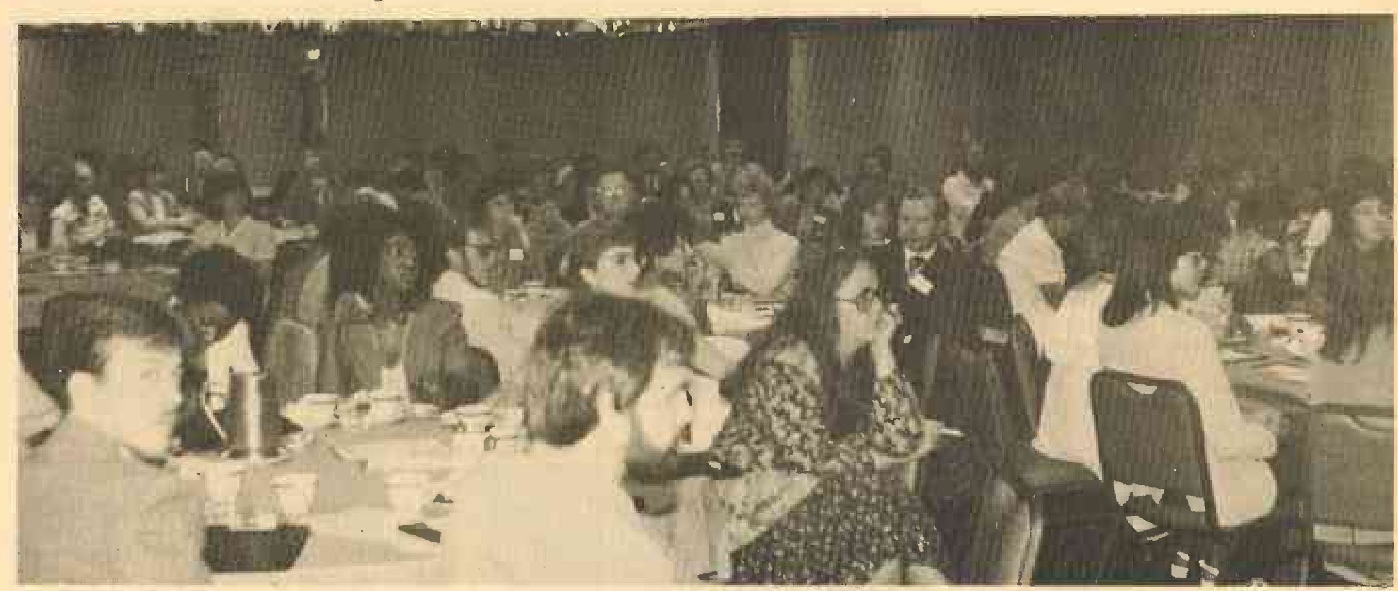
Participants attend the 1982 North Central Regional Educational Conference held in Milwaukee, September 30 to October 2.

The Fall brought cooler weather, brilliant foliage and the last of the 1982 OPEIU Regional Educational Conferences. After the Spring's Southwest/Southeast and Eric Conferences and a summer break, three Conferences were held this Fall across the nation which more than 250 members, staff and officers attended—Northeast, Western and North Central.