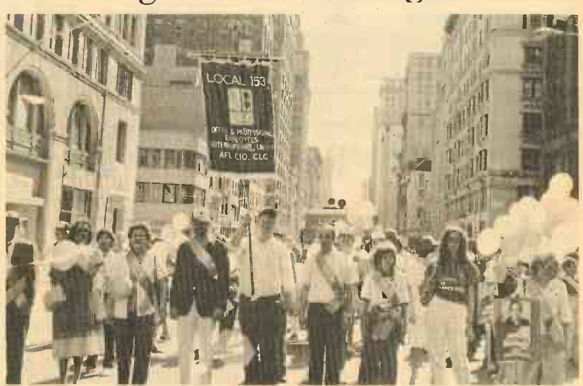
Members of OPEIU Local 153 march down Fifth Avenue in New York City's Labor Day Parade.