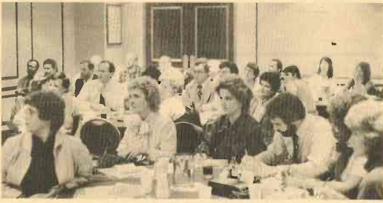
Participants at Full-Time Staff Training Conference in New York City attend Basic Arbitration course to improve their skills.

Through several role-playing exercises, including a mock arbitration case, the participants were able to demonstrate their skills and to receive feedback from