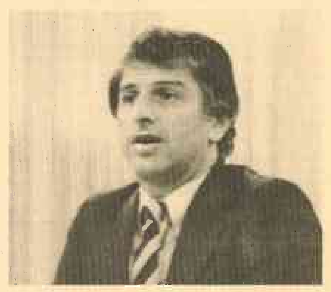
U.S. Representative Toby Moffett (D-CT), who is an OPEIU-endorsed candidate for Senator, addresses the Northeast participants.

In addition to the Midwest Council, the following Locals were represented at the Conference: 1 (Indianapolis); 9 (Milwaukee); 12 (Minneapolis); 28 (Chicago); 35 (Milwaukee); 39 (Madison, WI); 85 (Milwaukee); 95 (Wisconsin Rapids, WI); 311 (Kankakee, IL); 336 (Kenosha, WI); 391 (Chicago); 407 (Niagara, WI); 444 (Galesburg, IL); 498 (Cudahy, WI); 505 (Milwaukee); 515 (Clintonville, WI); 557 Milwaukee).