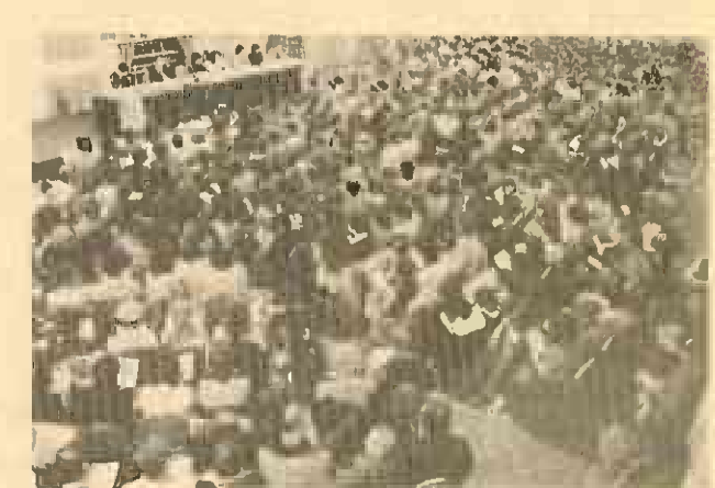
Prior to ratification, Local 434 members listen to explanation of their new agreement at Montreal City and District Bank.