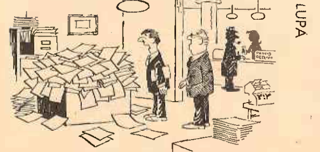
"She must be in there somewhere. I hear sobbing."

The employees also achieved an additional annual employer contribution of 12.5 cents per hour to the pension fund.