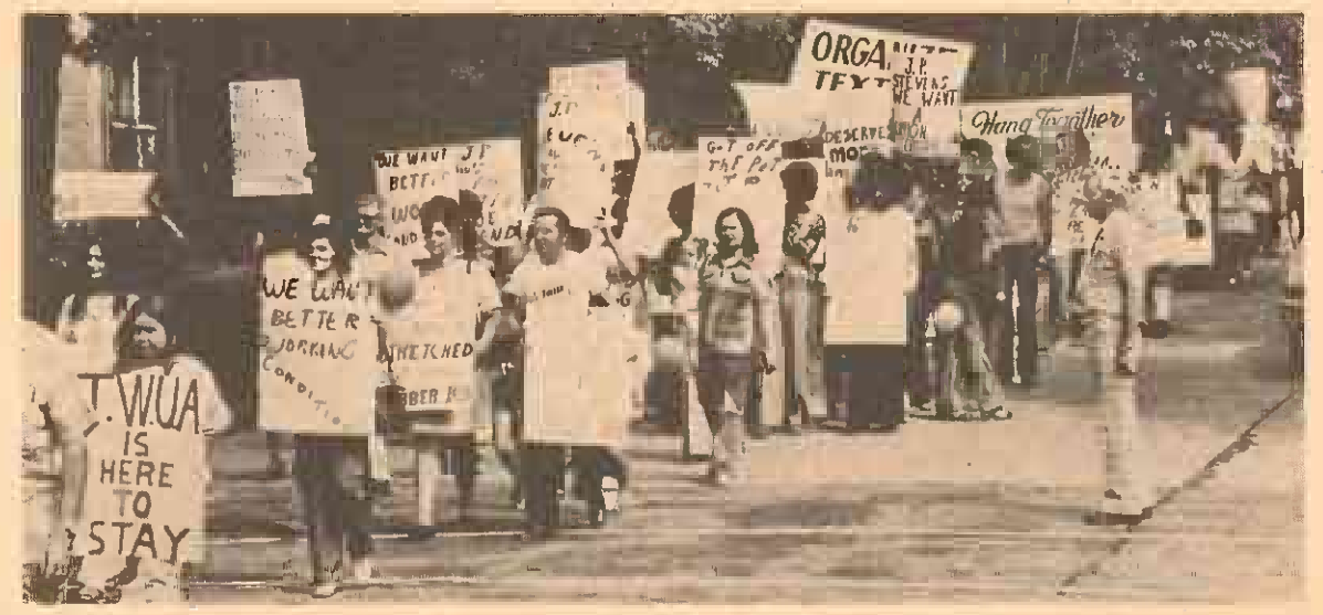
J. P. Stevens & Co. workers parading through Roanoke Rapids, N.C., in protest over stalling tactics of textile company in bargaining for an initial contract. The 1,200 textile workers in the march were joined by delegates from various TWUA Locals, joint boards plus supporting contingents from half-a-dozen other International Unions.

Once TWUA gains a first contract at Roanoke Rapids, assuring decent wages, fringe benefits and working conditions, the road to union security should not be so rocky for 43,-000 other employees at 82 other J. P. Stevens plants, or for the rest of approximately 700,000 unorganized textile workers in the South.