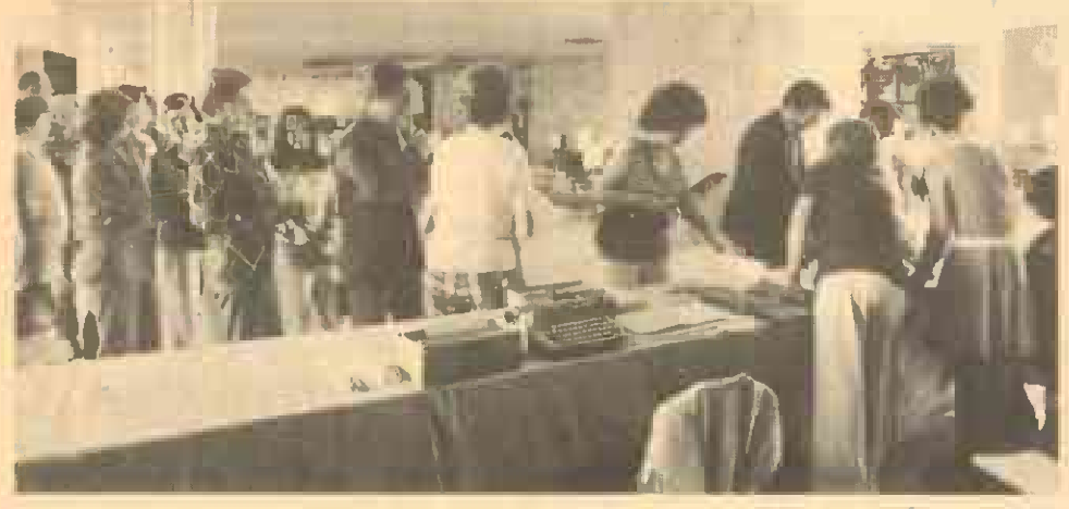
Delegates Registering at Hotel Deauville.