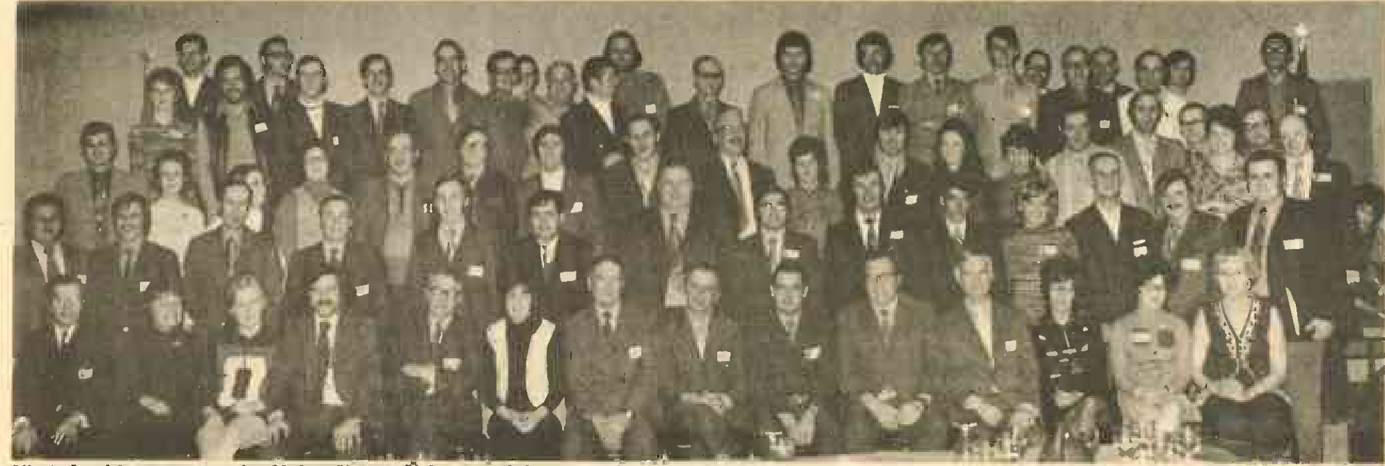
Ninety-five delegates representing 30 OPEIU Local Unions attended the fruitful conference of the Eastern Canada Council. Subjects discussed included collective bargaining, grievance handling, provisions of the unemployment insurance act, OPEIU structures and Convention resolutions of particular interest to Canadian members.