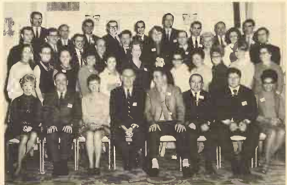
The East Canada Educational Conference in Toronto.