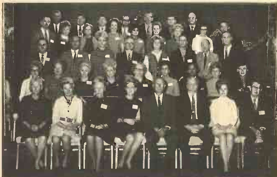
The Southwestern Educational Conference in Kansas City.