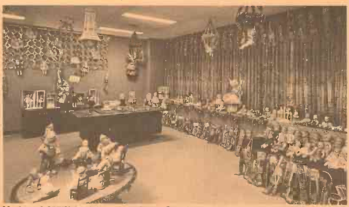
Members of OPEIU Local 2, employed by the Operating Engineers, the Operative Plasterers and the Roofers International unions, assembled this roomful of dolls and gifts and donated them to the Salvation Army for distribution to needy children in Washington, D. C., at Christmas.

Altogether, the labor press comes out with the highest batting average for accuracy and credibility of all the mass media studied in the survey.