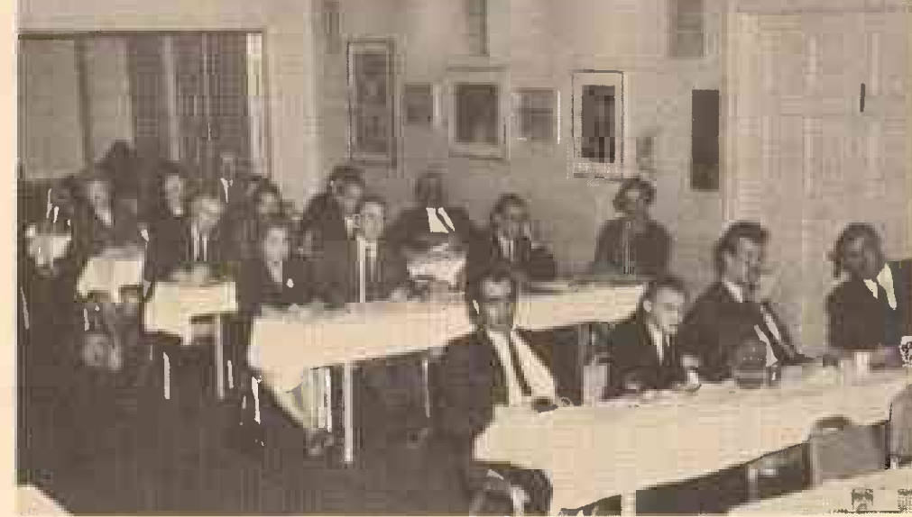
An attentive moment at the Montreal conference of representatives of the OPEIU and its local union affiliates. More photos on page 3.