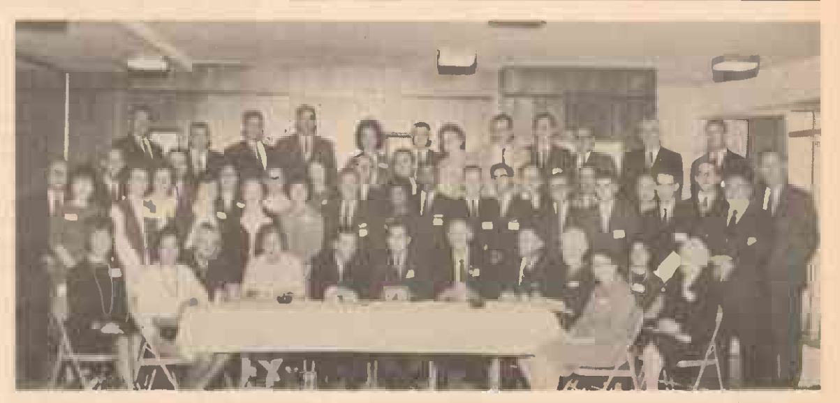
A photo portrait of the highly productive North Central Educational Conference held at La Cross, Wisconsin Sept. 18-19. OPEIU Local 44 was host to the gathering.

U. S. Department of Agriculture statisticians say some of the increase is due probably to the fact that there are now more people of smoking age. But they also point out that many people who had switched to pipes and cigars after the Surgeon General's report, or had temporarily quit smoking entirely, may now be back at cigarette smoking.