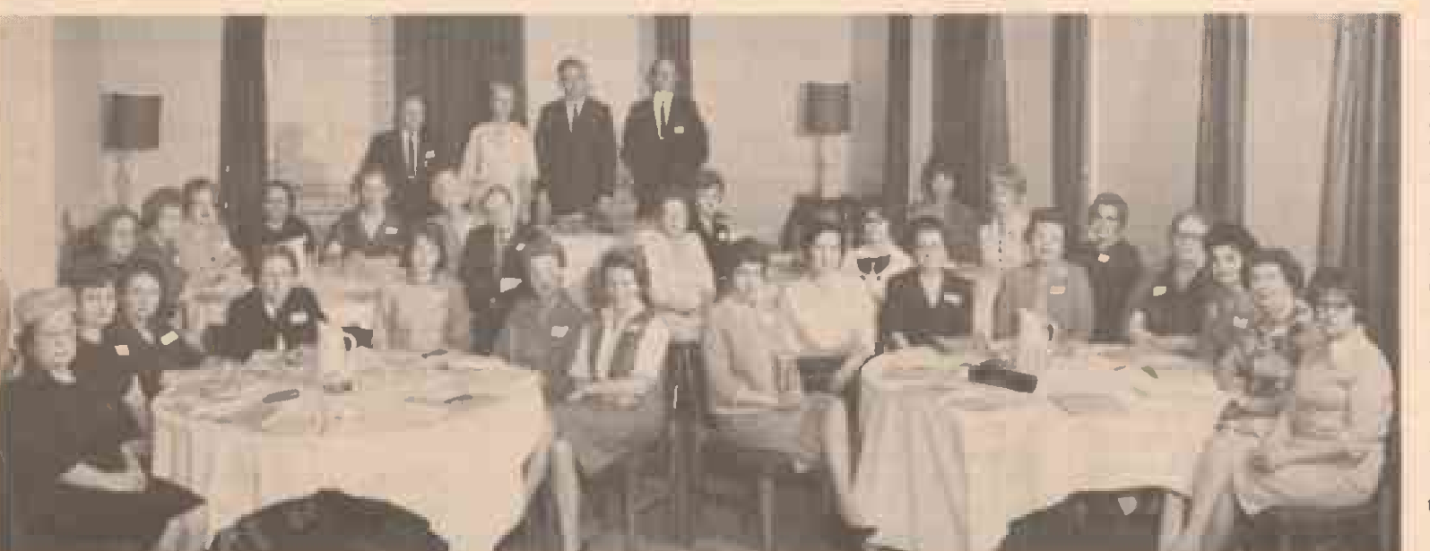
Local 320, Kansas City, Mo., held its second annual workshop on March 27. The meeting was held in the Continental Hotel.