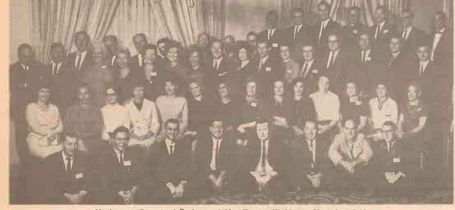
Northwestern Educational Conference, held at Tacoma, Washington, November 13-14. (* an arting on these *)

• In the year ending June 30th, it was found that 18,605 children were illegally employed: 7,076 on farms, 11,529 in other businesses. The record for the previous year was even worse: 21,006 minors were employed in prohibited work.