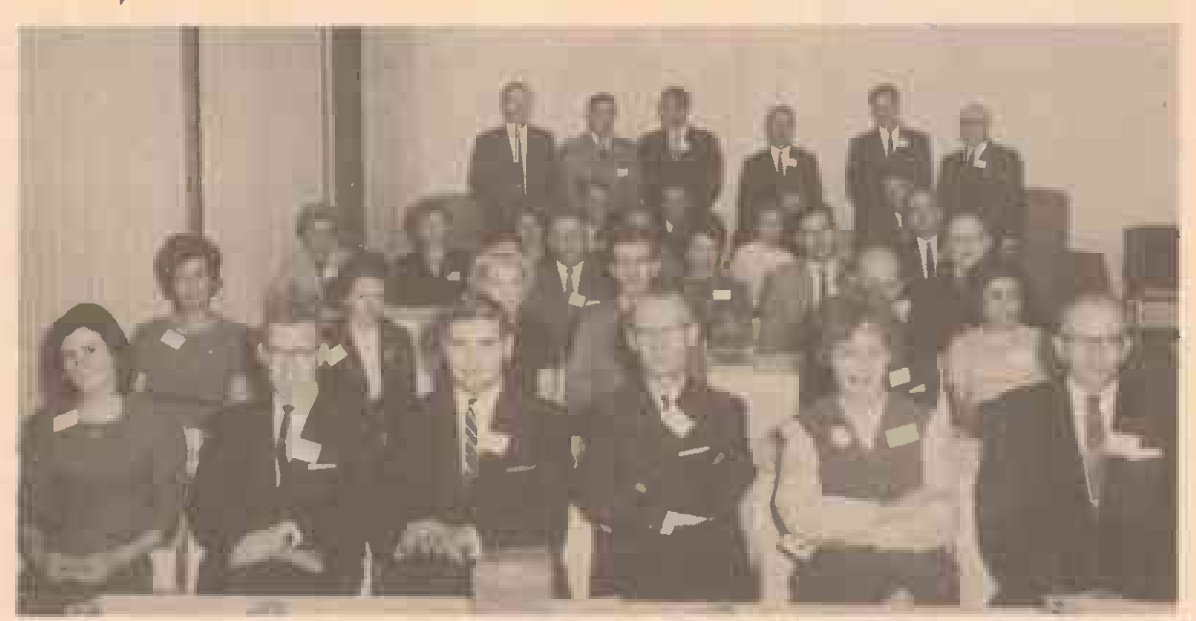
The Canadian Educational Conference, held in Toronto, Ontario, October 23-24.