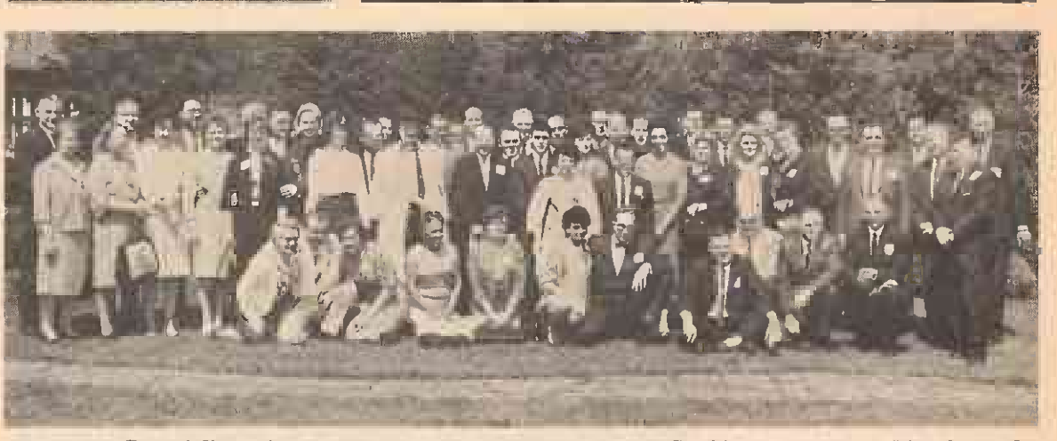
The North Central Educational Conference was held at Wisconsin Rapids, Wisconsin on May 2 and 3.

Non-economic changes in the agreement include provisions that bargaining unit employees will be given first opportunity to perform overtime work of a type normally performed by the bargaining unit; employees will not be kept in temporary classifications for more than 90 days; and job vacancics in all grades are to be posted (previously in only the four highest grades). The severance-pay provision is liberalized to allow severance pay in cases of "non-disciplinary discharge for failure to maintain performance standards, where such failure to meet performance standards is not due to lack of application on the part of the employees."