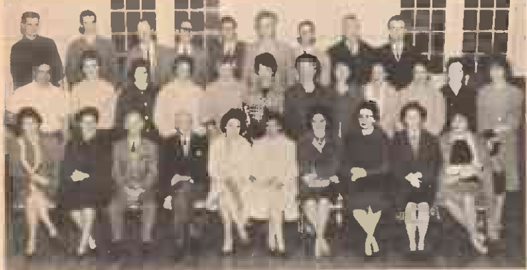
Local 15 members employed at the Yarrows Shipyards refused to cross the picket lines of 22 unions. The strike has since been successfully won.

Local 15 Supports Striking Shipyard Workers