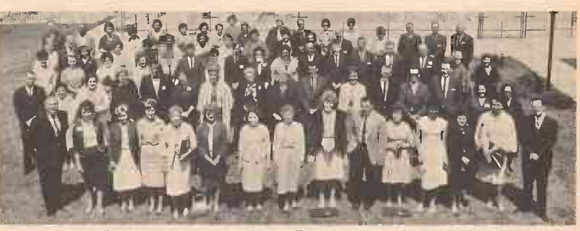
The Eric Educational Conference was held in Flint, Michigan on April 25 and 26, 1964.

pany after reaching a satisfac- vestigated the union's charges, law.