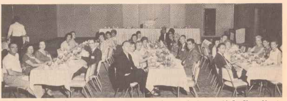
The Western Educational Conference of the OEIU met recently at the Flamingo Hotel in Las Vegas, Nevada.