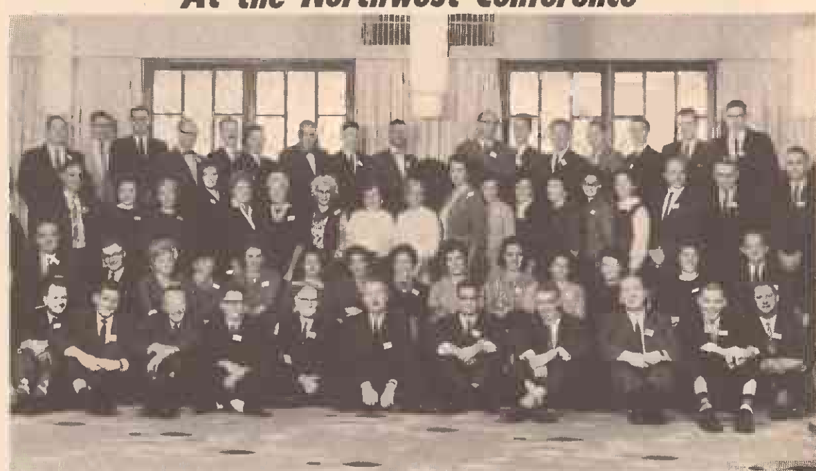
The delegates who met in Vancouver for the meeting held October 26, 27.