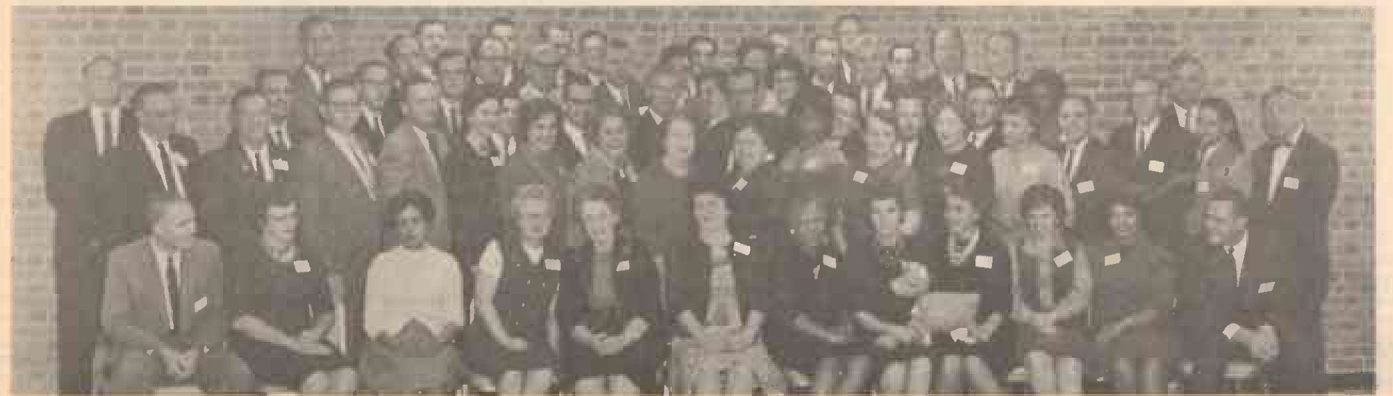
The North Central Educational Conference met in Joliet, III.