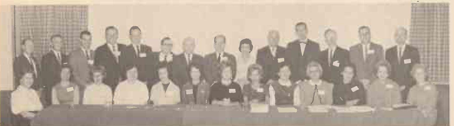
The Southeast Educational Conference met Oct. 31-Nov. 1 in Lexington, Ky.