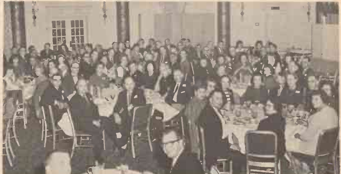
The Northeast Educational Conference was in session in New York City on Nov. 7-8.