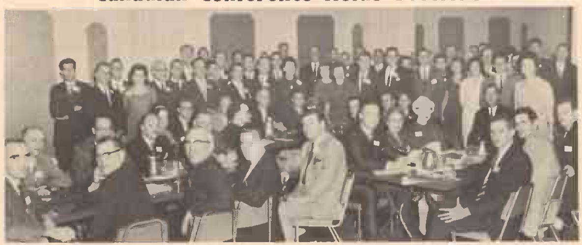
Above and below are views of delegates as they met in convention.