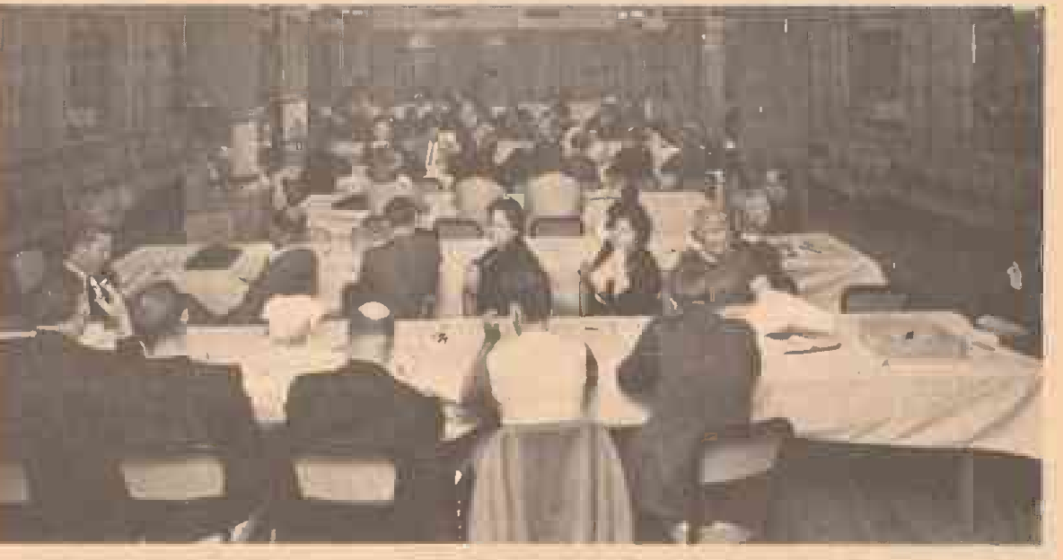
The Northeast Educational Conference was held last month in Washington, D. C., March 14-15.