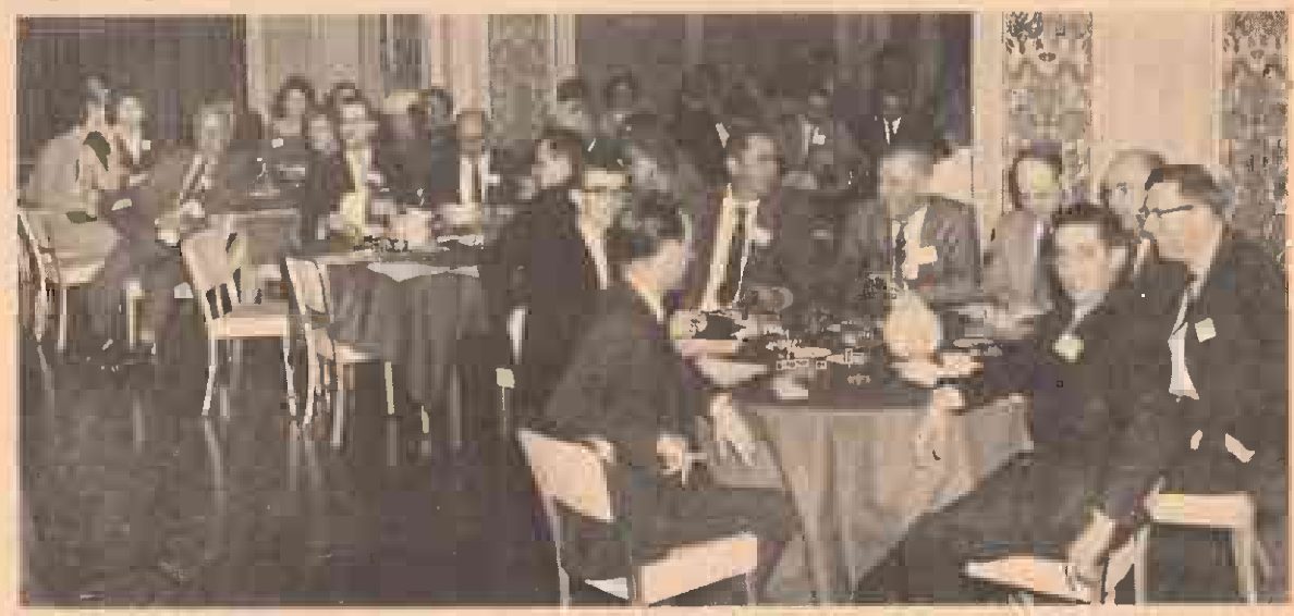
Above are some of the delegates during the sessions of the conference. The subjects of grievance and arbitration procedures were discussed at length. The delegates found the discussion in these areas to be particularly interesting, and the group discussions highly informative.