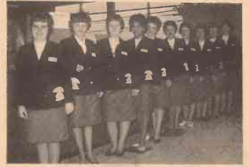
Members of OEIU Local 15, Vancouver, are shown sporting new uniforms with the Credit Union insignia on them. These members are employed at the Alberni and District Credit Union office, Port Albernia, British Columbia.