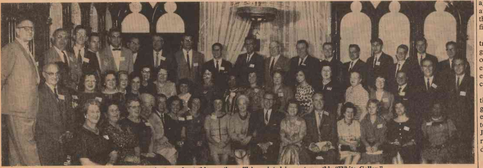
A story about this meeting will be printed in next month's "White Collar."