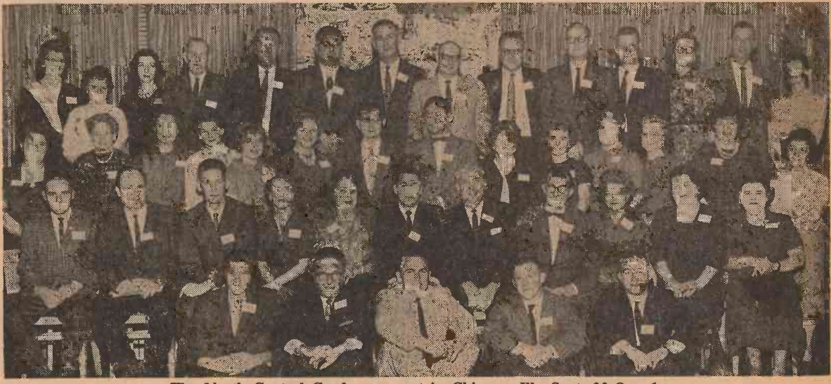
The North Central Conference met in Chicago, Ill., Sept. 30-Oct. 1.