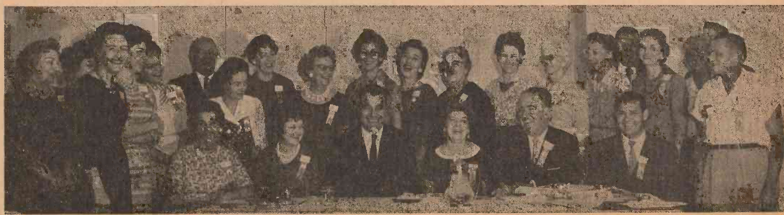
Meetings of the Southeastern Conference were held in Memphis, Tenn.