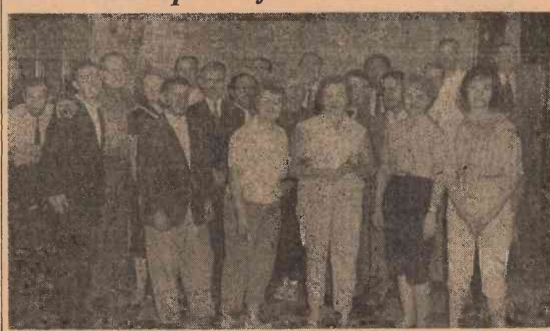
Shown at reception in Toledo, Ohio, are officials of Brazilian Commercial Workers Unions and members of OEIU host local 19.