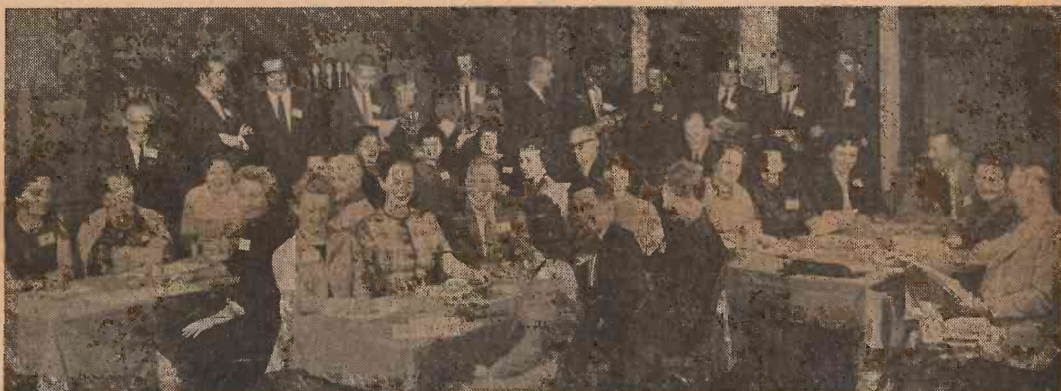
The Pacific Northwest Conference meetings were held in Tacoma, Wash.