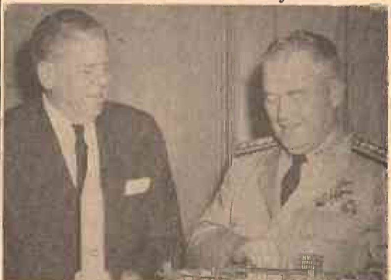
Rear Admiral William F. Raborn, USN, Director of the U. S. Navy's Polaris missile program, presents model of the "U. S. S. George Washington," an atomic submarine capable of firing the Polaris missile, to U. S. Secretary of Labor James P. Mitchell. The models will be part of a Labor Department exhibit depicting the theme "Skilled Workers Defend America." Members of the Office Employees International Union, Local 106 are on the team that helped produce the mobile atomic submarines at the Electric Boat Division of General Dynamics Corporation in Groton, Conn.