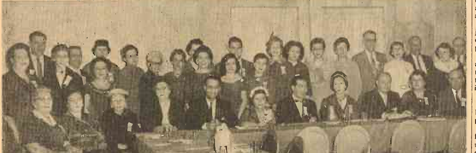
The Southeastern Organizational Conference recently held its semi-annual meeting at the Dinkler Plaza Hotel in Atlanta, Ga. During the meeting there was an extended session devoted to discussion of the recently passed Labor-Management Reporting and Disclosure Act of 1959. The Conference voted that future meetings of the Southeastern Organizational Conference be of two days' duration.