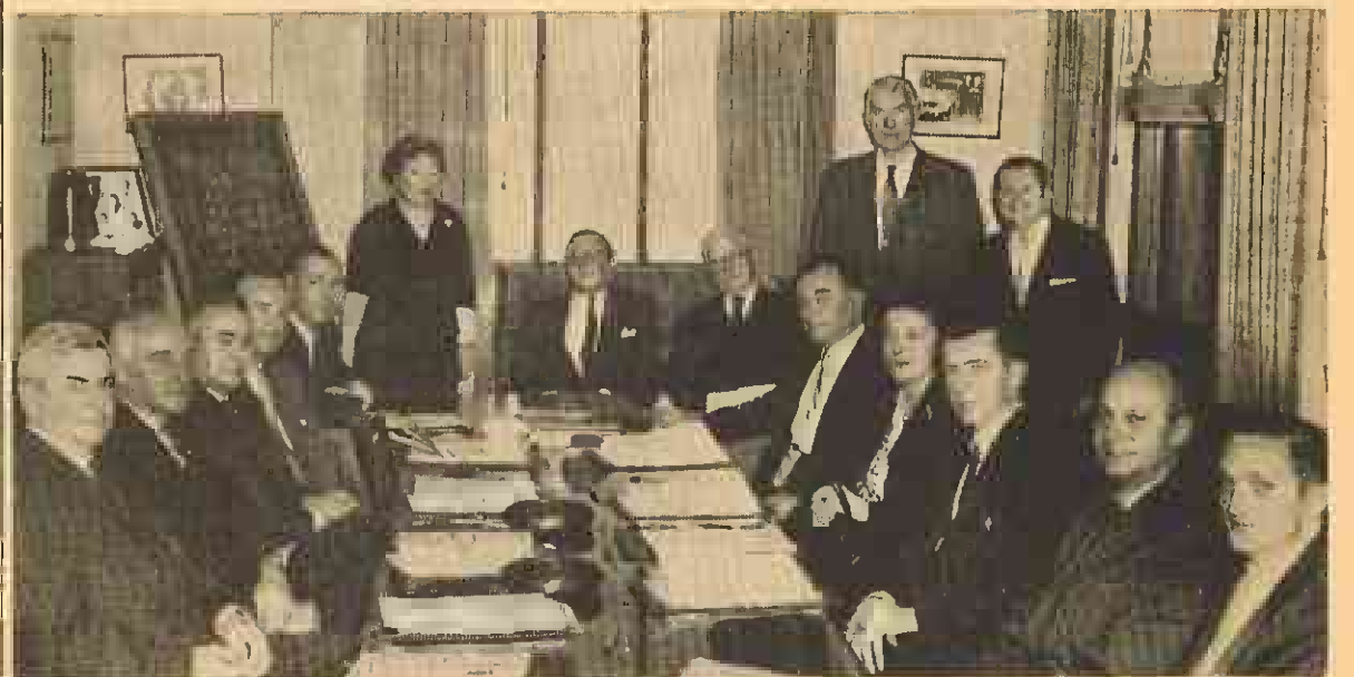
Representatives of Local 153, New York City, recently met with representatives of management, the Governor's Committee on Employing the Physically Handleapped, the New York State Employment Service, and the Medical Director of the Workmen's Compensation Board, to work out means of employing the physically handleapped in jobs suitable for such employes. OEIU Local 153 promised complete cooperation in the use of their free place-