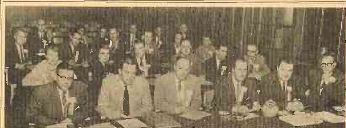
Delegates in session at the Canadian Organizational Conference, held in Chateau Frontinac in Quebec City.