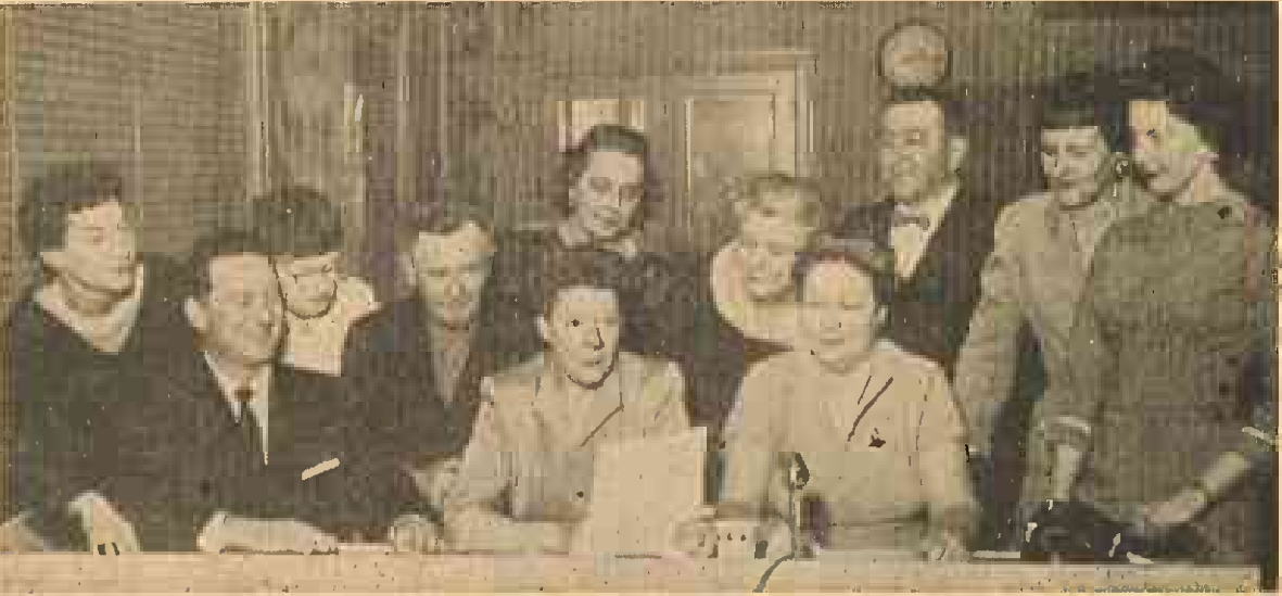
OEIU Local No. 42 in Detroit which was one of the first local unions to merge with a CIO Office Employes Union as a result of the AFL-CIO merger, recently installed its newly-elected officers, shown above.