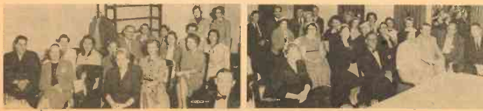
Delegates of local unions affiliated with Western Organizational Conference as shown at biannual meeting of the Conference in San Francisco.

Much credit is due to Vice Presoperation in the discussions which new local union.