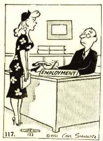
"I left my last job because of illness. It was non-union, and I got sick of it!"