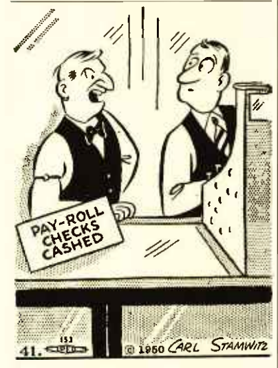
"Got some small change? . . . That non-union firm is paying today!"

One dollar is a small investment to make to help elect your friends to Congress, the state legislature and the city council. Don't forget to contribute to Labor's League for Political Education.