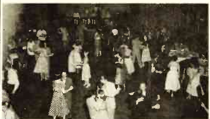
Washington-The annual Spring Dance of Washington Local 2 of the OEIU was a treat for all who participated. Shown above are a few of the guests enjoying themselves.