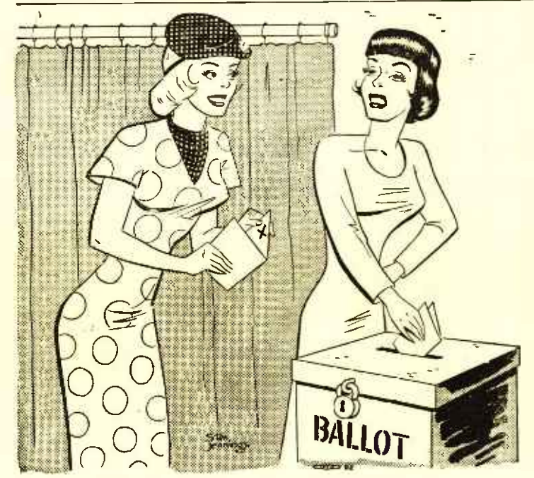
"Why shouldn't I vote against Senator Grapht? He's been voting against me for six years!"