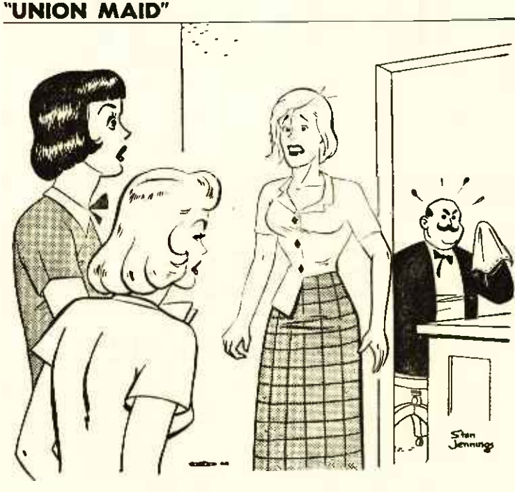
"Believe me, girls, collective bargaining is the only way to deal with the boss!'

An employe had on company time handed out application cards