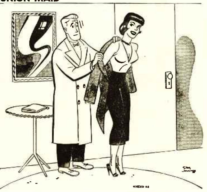
"We'll have to go to an early movie . . . Our local meets tonight at 9:30!"