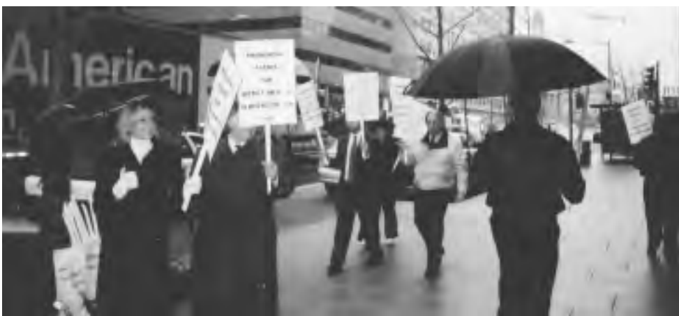
OPEIU pickets the National Labor Relations Board on Wednesday, December 17 in Washington, D.C.