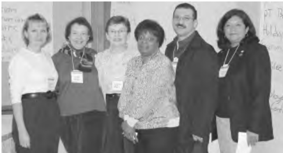
Members of Local 28.