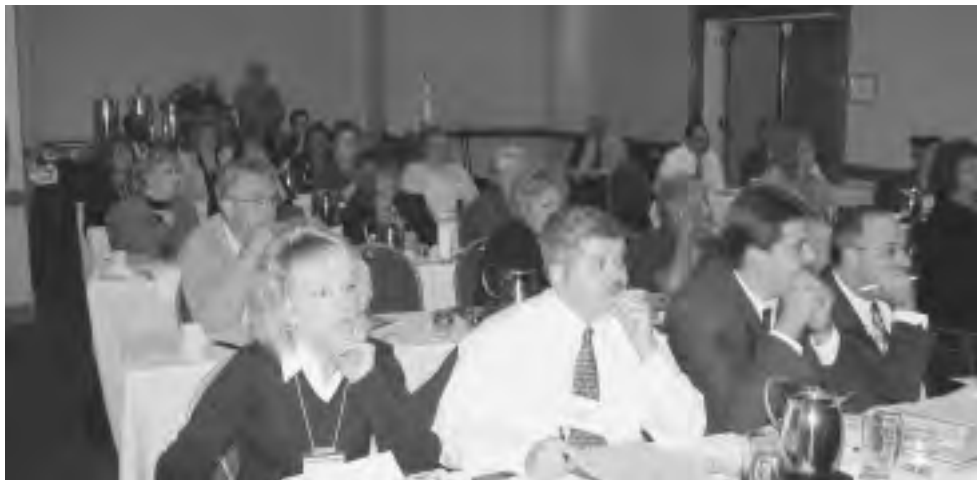
OPEIU Healthcare Pennsylvania, Local 112 delegates.