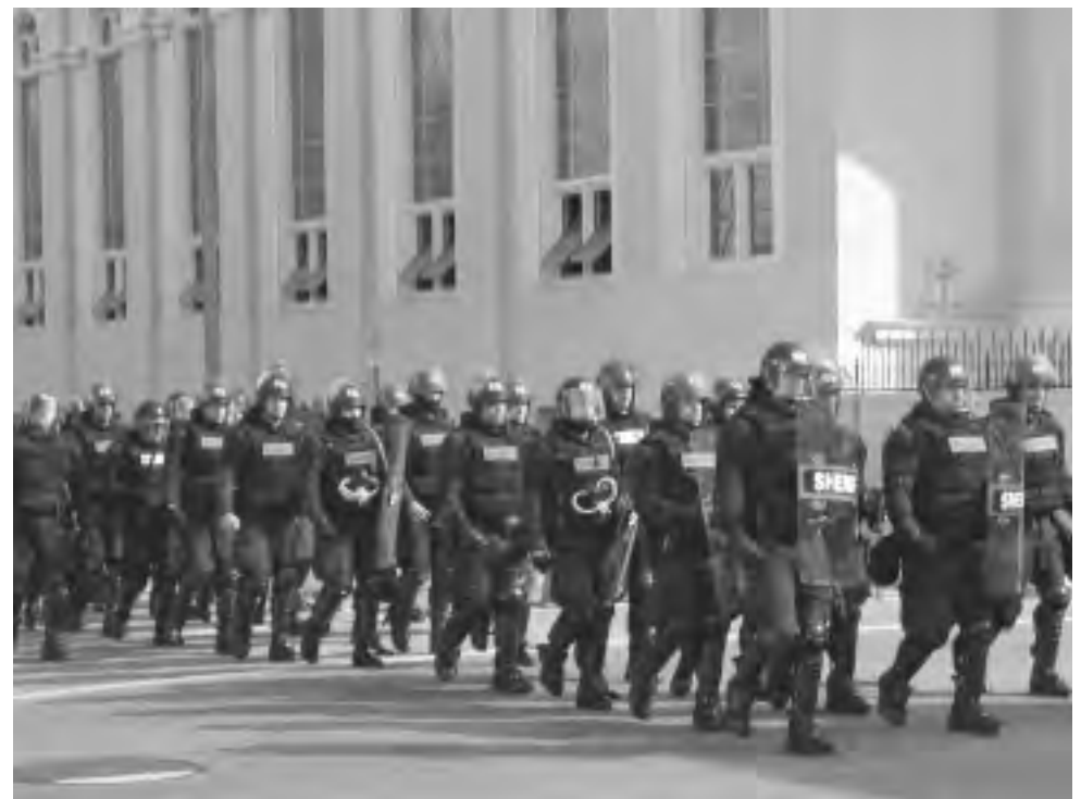
Heavy police presence on hand. Labor officials are calling for an investigation into police mismanagement at the protest.