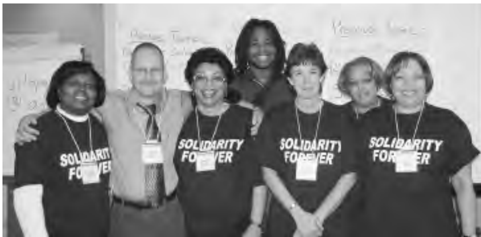
Local 391 delegates.