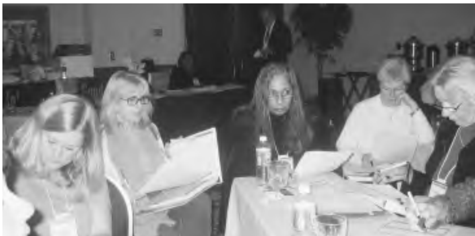
Local 6 and Local 153 members busy at work.

As usual, the conferences included an opportunity for participants to privately meet with International President Goodwin to discuss issues of concern.