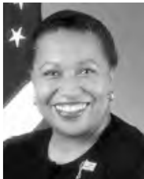
Carol Moseley Braun