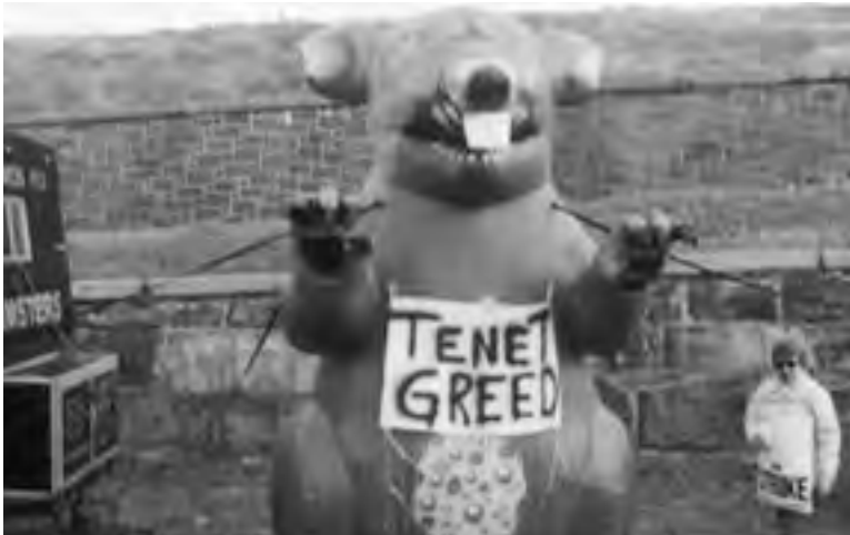
An 18-foot rat protesting “Tenet Greed” was on the picket line in support of the nurses.