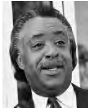
Rev. Al Sharpton

values and many other issues that are simply not germane to your relationship with your employer and your need to have a good paying secure job. These issues have to be separated from each other. The first thing you have to concentrate on is YOU and YOUR FAMILY and in most cases that means YOUR JOB. You must set aside personal beliefs and preferences in favor of your job. If you don't have a job, you won't have to worry about these other issues — you'll be too busy worrying about how to eat and pro-