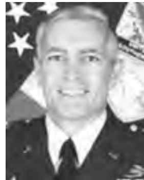
Gen. Wesley Clark