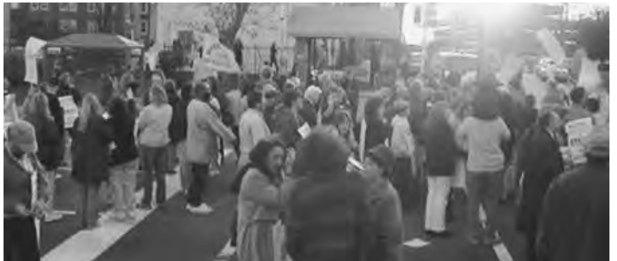
Union and community supporters join nurses at November 24 rally.

On November 11, 2003, 268 registered nurses employed by the Medical College of Pennsylvania Hospital went on strike, not over money or benefits, but over patient care standards and concerns