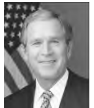
George W. Bush