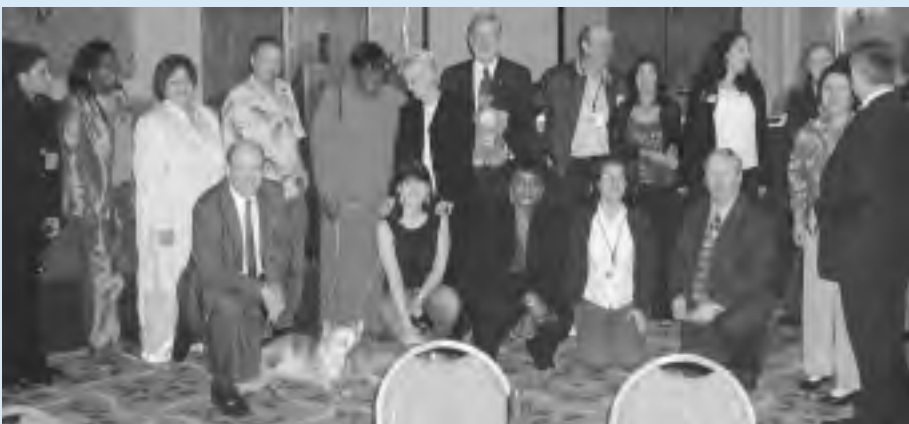
OPEIU members at the Fifth Biennial Convention of Pride At Work.