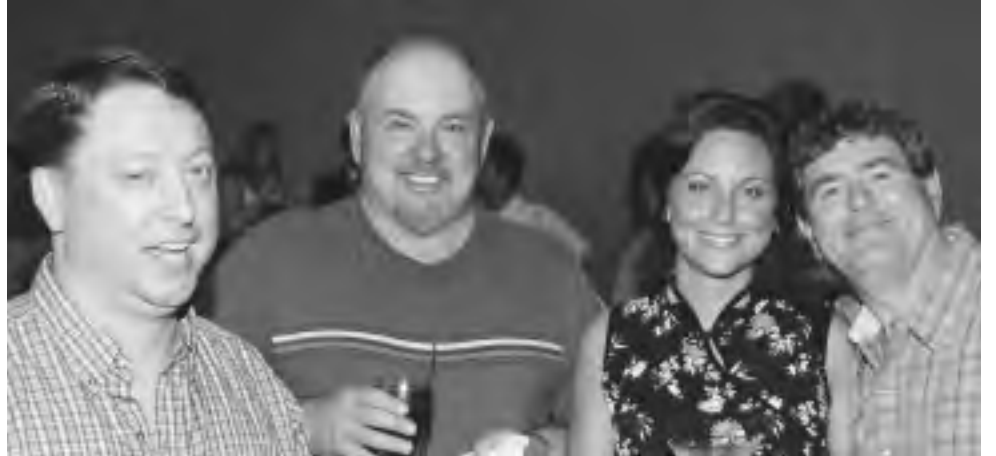
Some of the Canadian delegates who attended the convention.