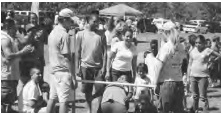
Local 30 members do the limbo!