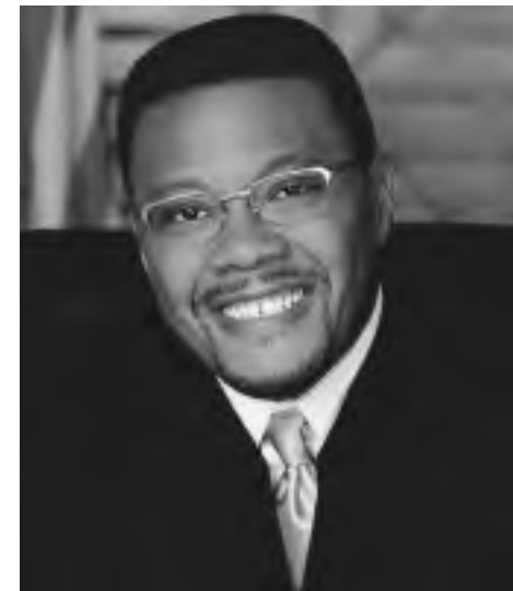
Judge Greg Mathis

Judge Greg Mathis, host of the television show, "Judge Mathis," gave an impassioned speech that thanked the labor movement for its support over the years, and said, "I thank God for all of you, the union members of America." He also spoke of the new position he'll be assuming in January 2005 as national president of the Southern Christian Leadership Conference. It's an organization founded by Dr. Martin Luther King Jr. as an avenue to achieve equal justice and equal rights.