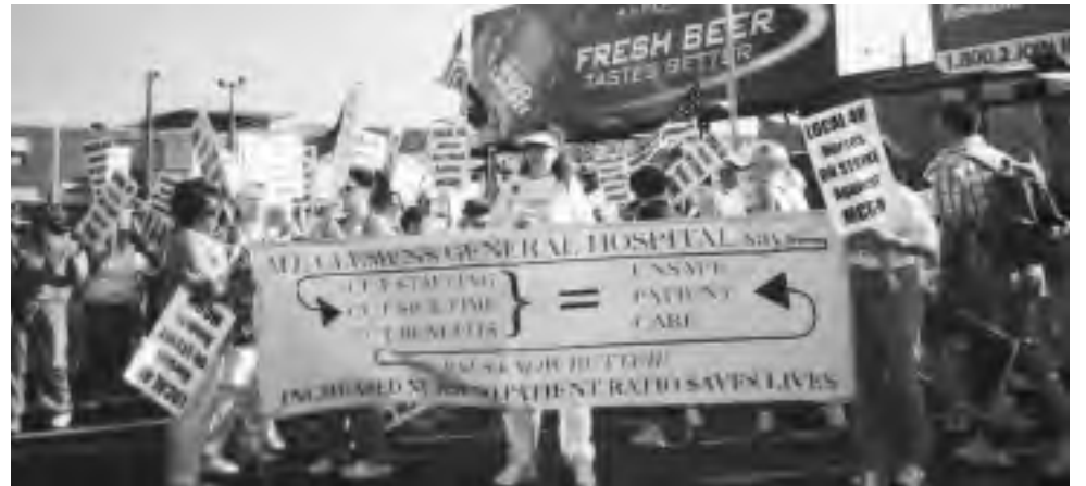
Local 40 nurses at Mt. Clemens General Hospital walk the picket line.