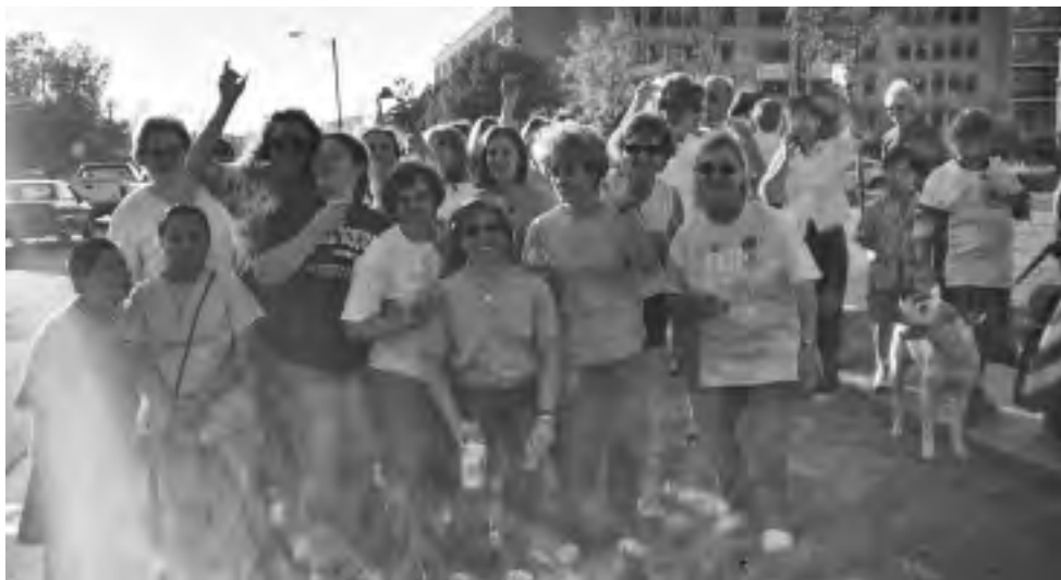
Nurses celebrate their contract victory!