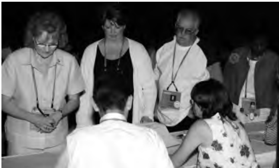
Convention delegates receive ballots for vice president elections.