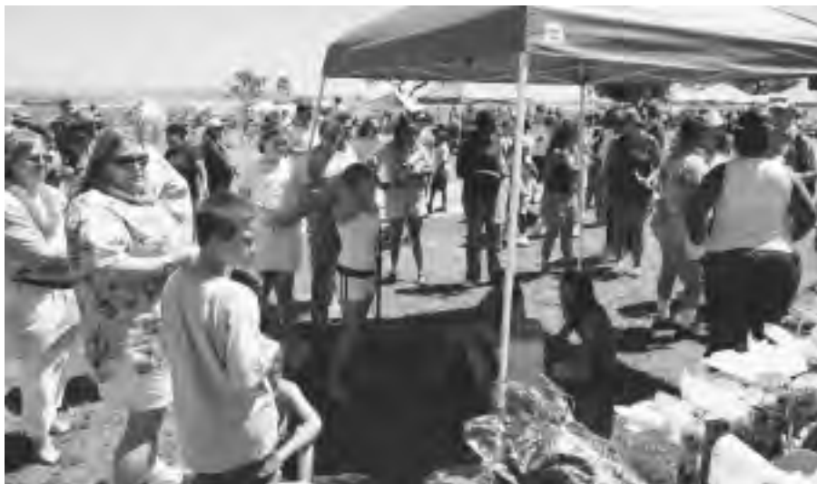
Local 30 members and families have a great time at the Family Fun Day.