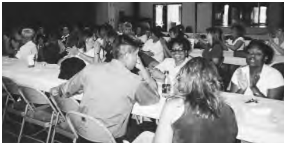
Wanigas employees, members of Local 393, are happy with the contract.

We are confident that we will succeed in giving our members the understanding that despite these precarious times, union people will prevail and solidarity is alive and well!