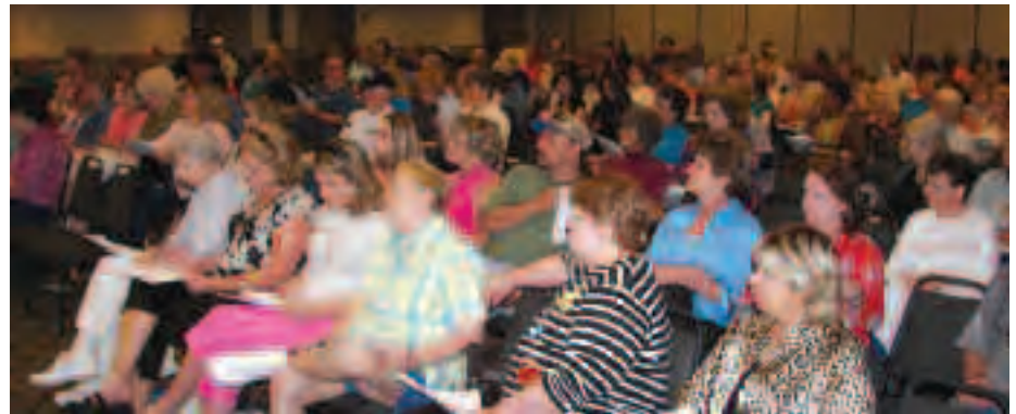
Local 277 members ratify the new contract with Lockheed Martin on May 13, 2006.