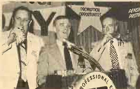
VP Moss and Coughlin Display Approval