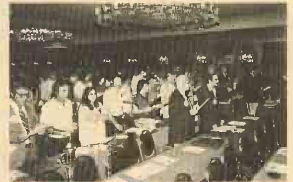
Delegates Sing Following Nomination