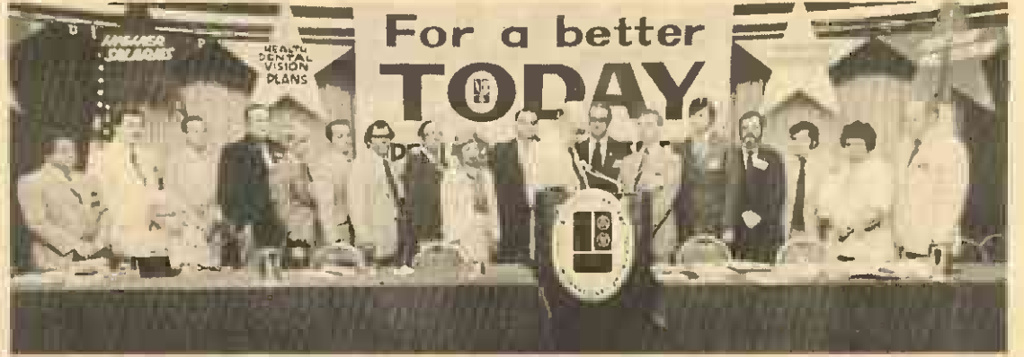
Coughlin Swears in Officers