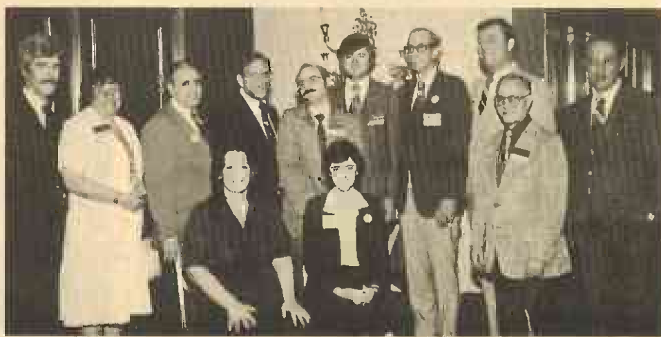
Convention Hosts—Local 153