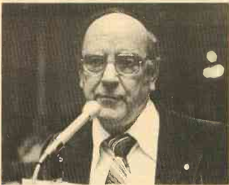
Corbeil Seconds Kelly's Nomination