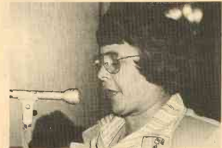
Newton Seconds the Nomination