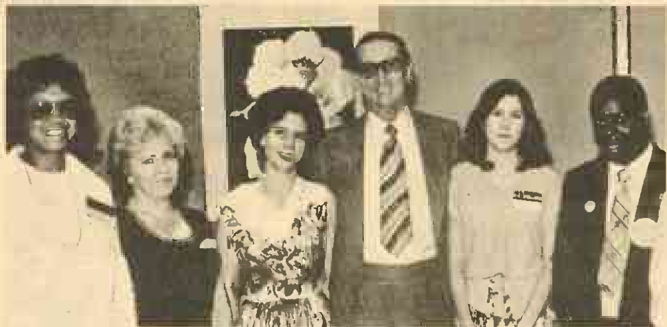
Washington International Staff

To put on a convention the size and length of the OPEIU Convention takes a great deal of time and effort. Without a concerted effort by a number of people, such an event cannot take place.