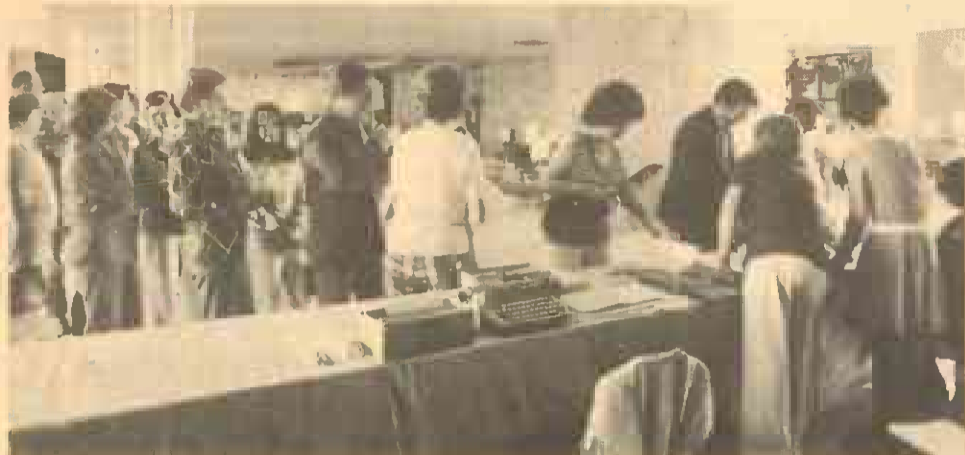
Delegates Registering at Hotel Deauville.