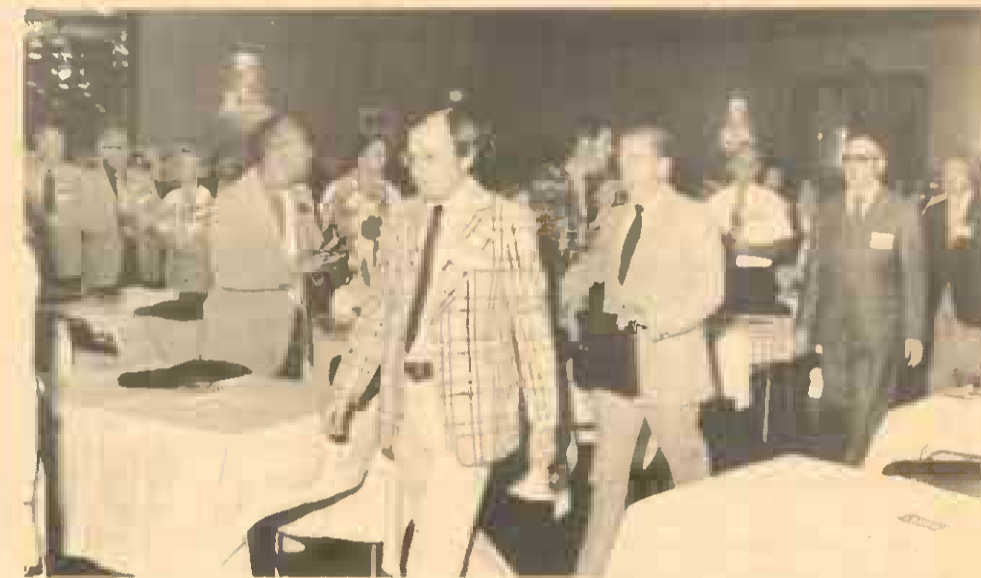
WILLIAM P. KELLY, assistant Deputy Minister of Industrial Relations of the Canada Department of Labour, (holding briefcase) is escorted to the dais.