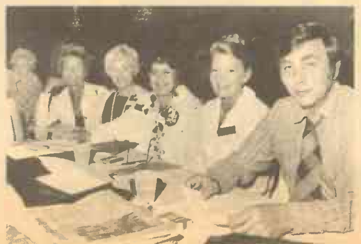
Photos show delegates during working sessions at Convention