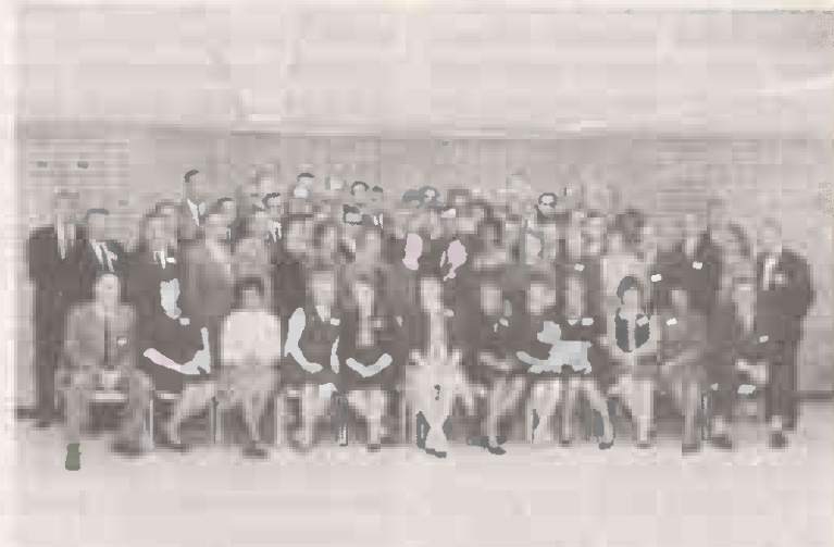
The North Central Education Conference was held in Joliet, Illinois, on October 10 and 11.