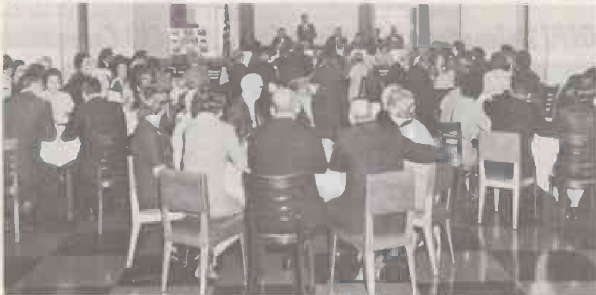
Delegates to the Erie Educational Conference met Oct. 17-18 in Pittsburgh, Pa.