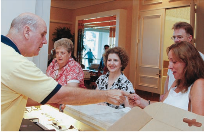
OPEIU delegates register for the 24th Triennial Convention.