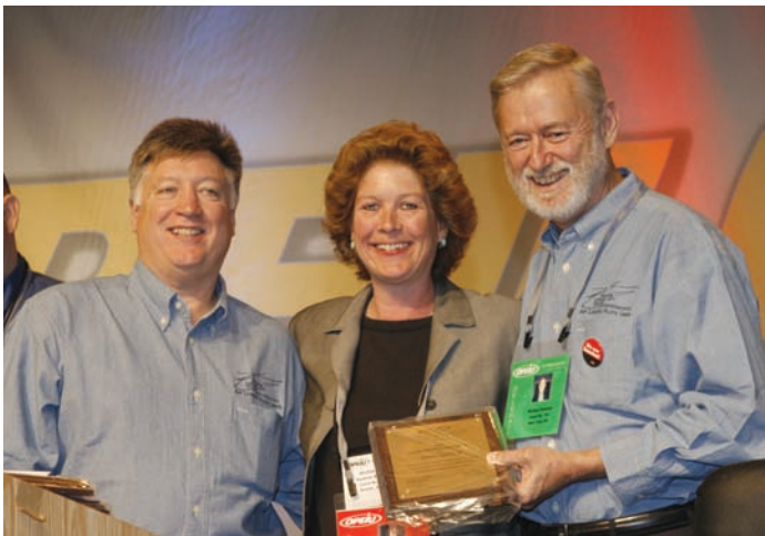
Local 8, Seattle receives the Gold Award.