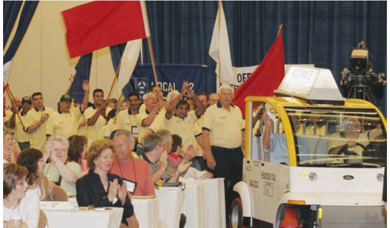
Members of the Alliance parade into the general session showing their support for the OPEIU.