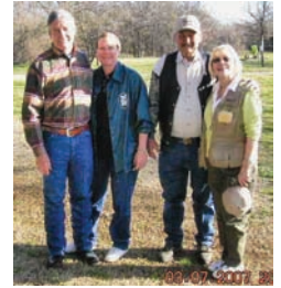
The Local 277 shooting team, comprised of members at AIL state agencies in Dallas, Houston and San Antonio.

To see a calendar of events for this year, pictures from past shoots, and other information, as well as sign up for the newsletter, visit Shoot For A Cure’s website at www.birdslandling.net , then click on the red Leukemia icon on the left side.