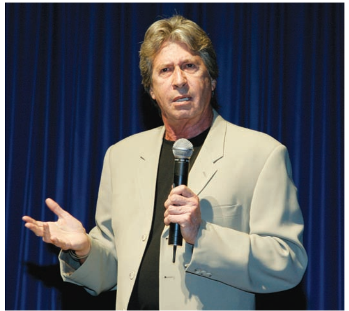
Comedian David Brenner entertains the delegates.