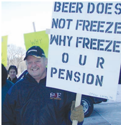
On the picket line at Miller Brewing.

($5,616 per year) into the 401(k) plan for every employee, including those eligible for a pension.