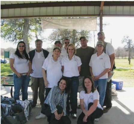
Local 277 members with American Income Life, the shoot’s sponsor.