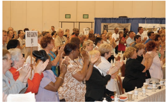
Delegates consider amendments and resolutions.